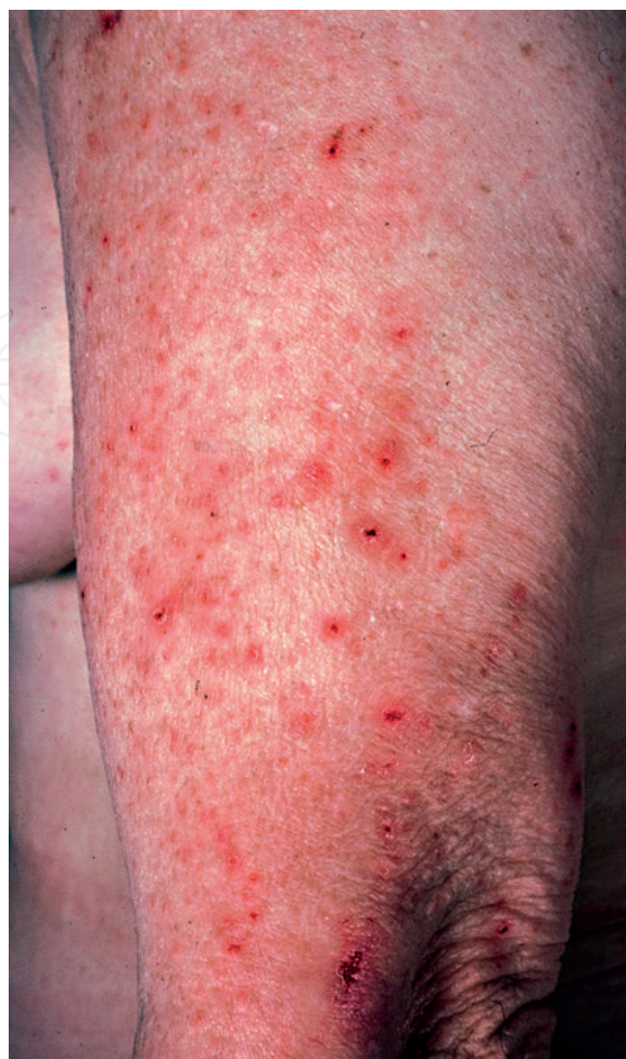
Figure 1. Excoriated papules and eroded vesicles in a patient with DH.

Only 20% of the DH patients develop gastrointestinal symptoms. These symptoms include diarrhea, anemia due to malabsorption, steatorrhea, weight loss, and malnutrition [54].