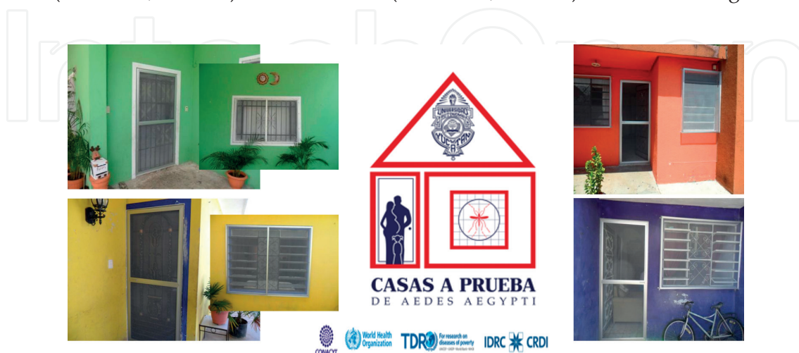
Figure 6. Aedes aegypti -proof houses.

The selection of these interventions was based on previous studies of our group. Briefly, from 2009 to 2014, cluster randomized controlled trials were conducted in the Mexican cities of Acapulco and Merida. Intervention clusters received Aedes aegypti -proof houses with ITS and followed-up during 2 years. Overall, results showed significant and sustained reductions on adult vector densities in houses in the treated clusters with ITS after 2 years: ca. 50% on the presence (OR \leq 0.62 , P < 0.05 ) and abundance (IRR \leq 0.58 , P < 0.05 ) of indoor-resting adults. ITS