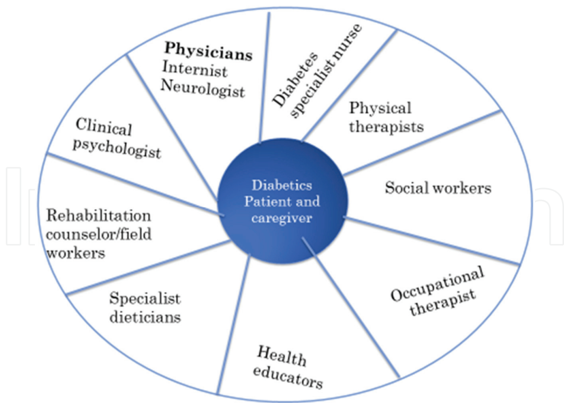
Figure 1. The multidisciplinary rehabilitation team approach centres on the patient and caregiver.

Physical therapy is a thus corner stone of prevention and treatment of diabetes mellitus. Physical therapy-directed movement and exercise programs are clinically effective in helping diabetic patients to produce the desired health-related quality of life (HRQOL) outcomes [11].