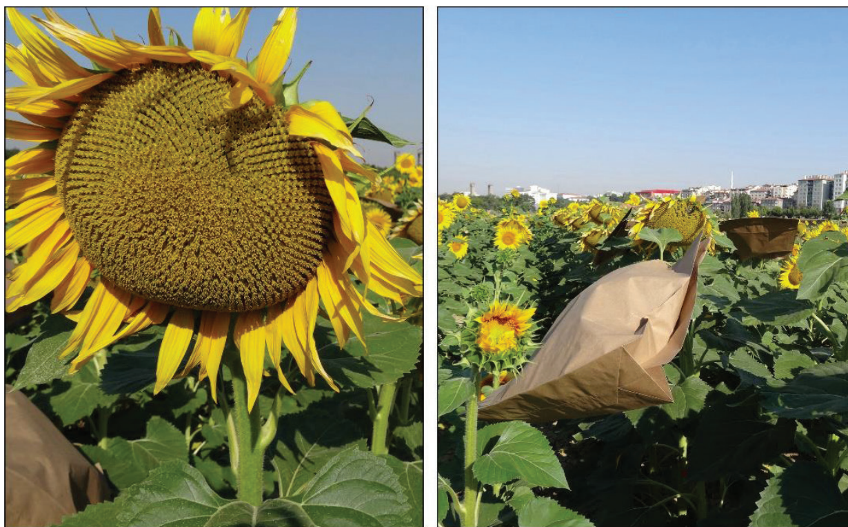
Figure 3. Flowering in the head (on the left) and covering the head with paper bags to protect seeds from bird's damage (on the right).

Measurements were performed in totally 30 plants (10 plants per replication) in each defoliation treatments in all cultivars. Seed yield per plant (g/plant), seed yield per decare (kg/decare), protein and oil percentages, crude protein, and crude oil yields (kg/decare) were recorded.