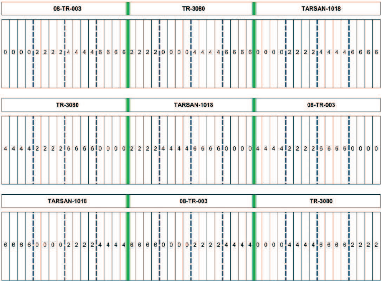
Figure 1. Sowing plan for sunflower cultivars according to the “randomized complete block, split-plots” design with three replications.

“08-TR-003,” “TR-3080,” and “TARSAN-1018” obtained from “Trakya Agricultural Research Institute” were used in the study. Soil of trial field was plowed 30 cm in depth in fall before winter. In spring, it was plowed again for 10–15 cm in depth to make soil ready for sowing. Sowing was performed in the first week of April with spaces of 70 cm inter-row and 25 cm on-row. Three seeds were put in each dibbling to guarantee the emergence. Two weeks after emergence, two of the plants were eliminated and only one plant left in each dibbling. For all defoliation treatments, plots were fertilized with 14 kg/da diammonium phosphate (DAP) before sowing. During growing, weed control was achieved by hand in experimental field. The study sowing plan is given in Figure 1 .