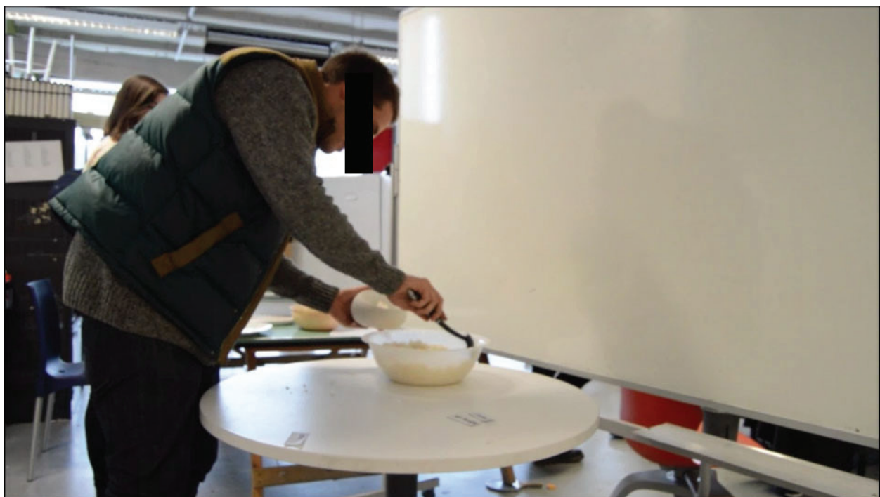
Figure 6. Photograph during test one.

The testing environment consisted of a partitioned-off area within a studio environment ( Figure 6 ). A video camera was set up to record the process. One table held a large bowl of rice with a serving spoon. The MindFull bowl and plate and a standard bowl and plate were placed out of sight behind a box. On the second table, a sheet of plastic was laid out with a camera on a tripod above to photograph the portion sizes.