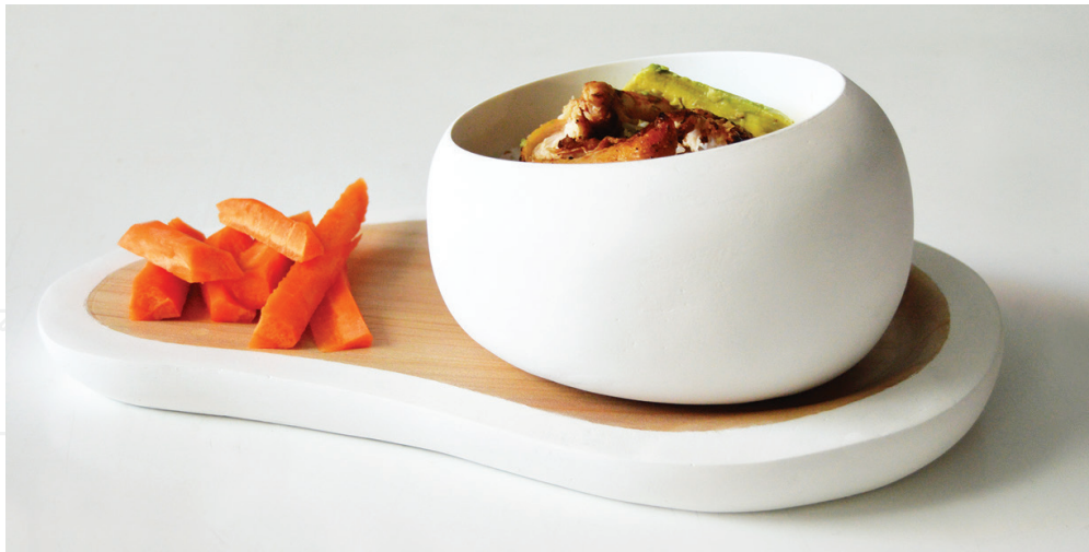
Figure 1. MindFull tableware.

There are many strategies to lose weight: various exercise programmes, diets including low fat and low carbohydrate diets and reductions in meal frequency, to name a few. In the end, weight loss works if energy intake is less than energy output. One of the simplest and most effective ways of doing this is through the reduction of portion sizes [4]. Our standard portion sizes have been consistently increasing which makes it easy to mindlessly overeat [5]. Portion control can be hard, particularly when adherence requires attention. Unfortunately, consciously restraining eating makes you more likely to eat the food you are purposely avoiding and increases the risk of bingeing [5, 6]. However, when people are unaware, smaller portions have very little effect on reported satiety [7]. Portion size reduction lends itself to long-term adherence, particularly for people who are not actively restricting their food intake.