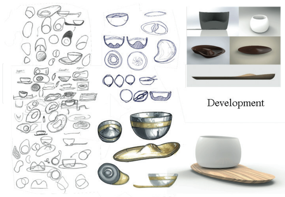
Figure 3. Development. Photo credit to Jessica Noone, Daphnee Belleil, Isla Davies and Lucy McMaster.

The team created a range of concepts, each with the aim of making the food on the plate or bowl seem larger ( Figure 3 ). The idea of a humped base to make the pile of food seem larger was developed further into the MindFull bowl and plate. The MindFull solution addresses the design implications from the literature review ( Figure 4 ). It uses heavy materials to create a false sense of density, and the design is wide to activate the haptic cues for size. The round curved form and asymmetry makes it harder to judge the volume accurately. The shape of the bowl forces users to hold the bowl flat on their hand or stretch their grasp, which enhances the sensory cues for size. The lack of a raised rim obliges the user to scoop their food slowly to stop the food from spilling. Similarly, the angles of the bowl's interior make it easy to chase food around in circles; slowing consumption. The surface finish is smooth rather than textured, to add to the impression of size. Finally, the rounded forms have association with a baby schema, hopefully, activating the attention bias to avoiding overeating due to distraction ( Figure 5 ).