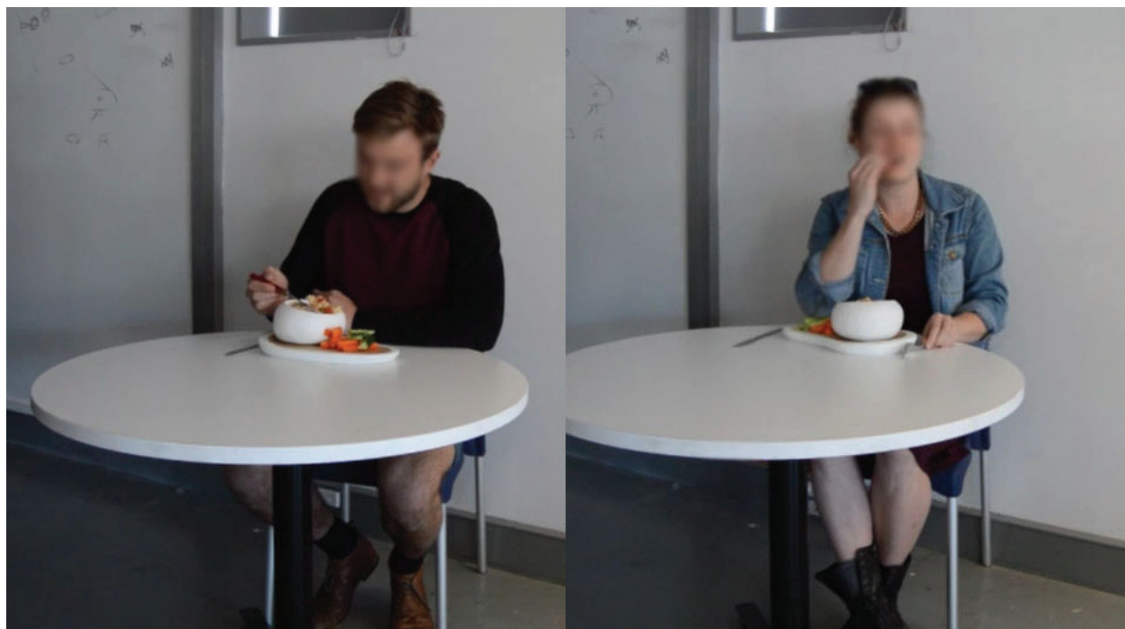
Figure 9. Photographs taken during test two.

A deductive thematic analysis was done of the conversations, questionnaire comments and semi-structured interviews looking for comments related to the perception-based design features and opinions on the design. The videos of the sessions were also analysed for behaviour and body language.