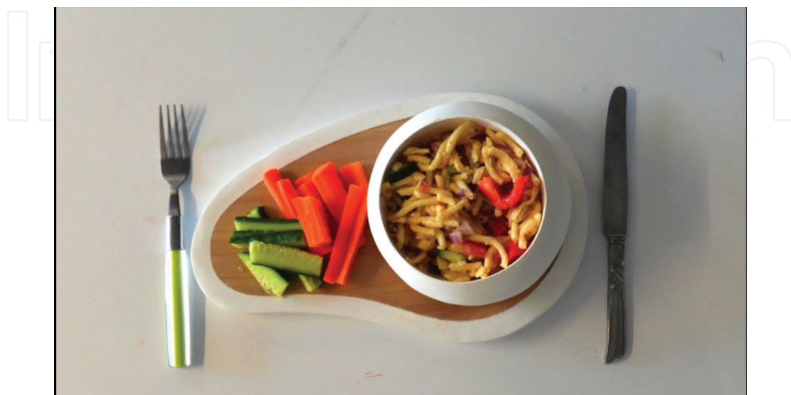
Figure 8. Food served in test two.

Participants were asked what time they had woken up, what they had for breakfast and what time they had eaten it. They were also asked to rate their hunger levels on a scale of