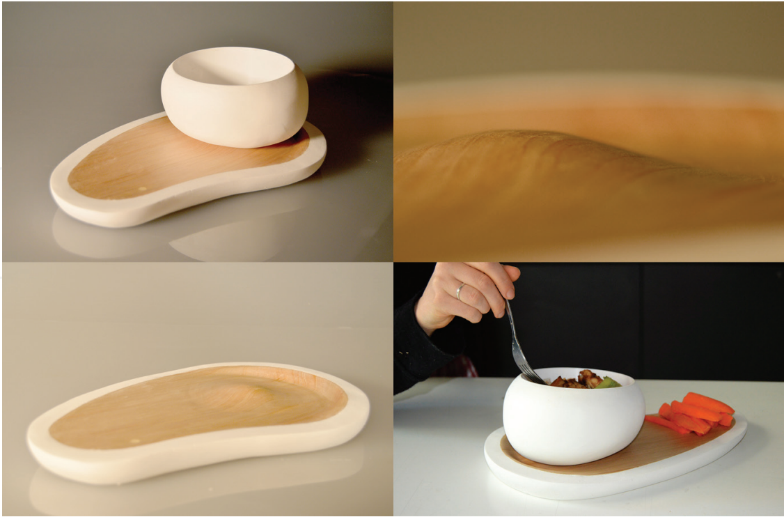
Figure 5. MindFull details.