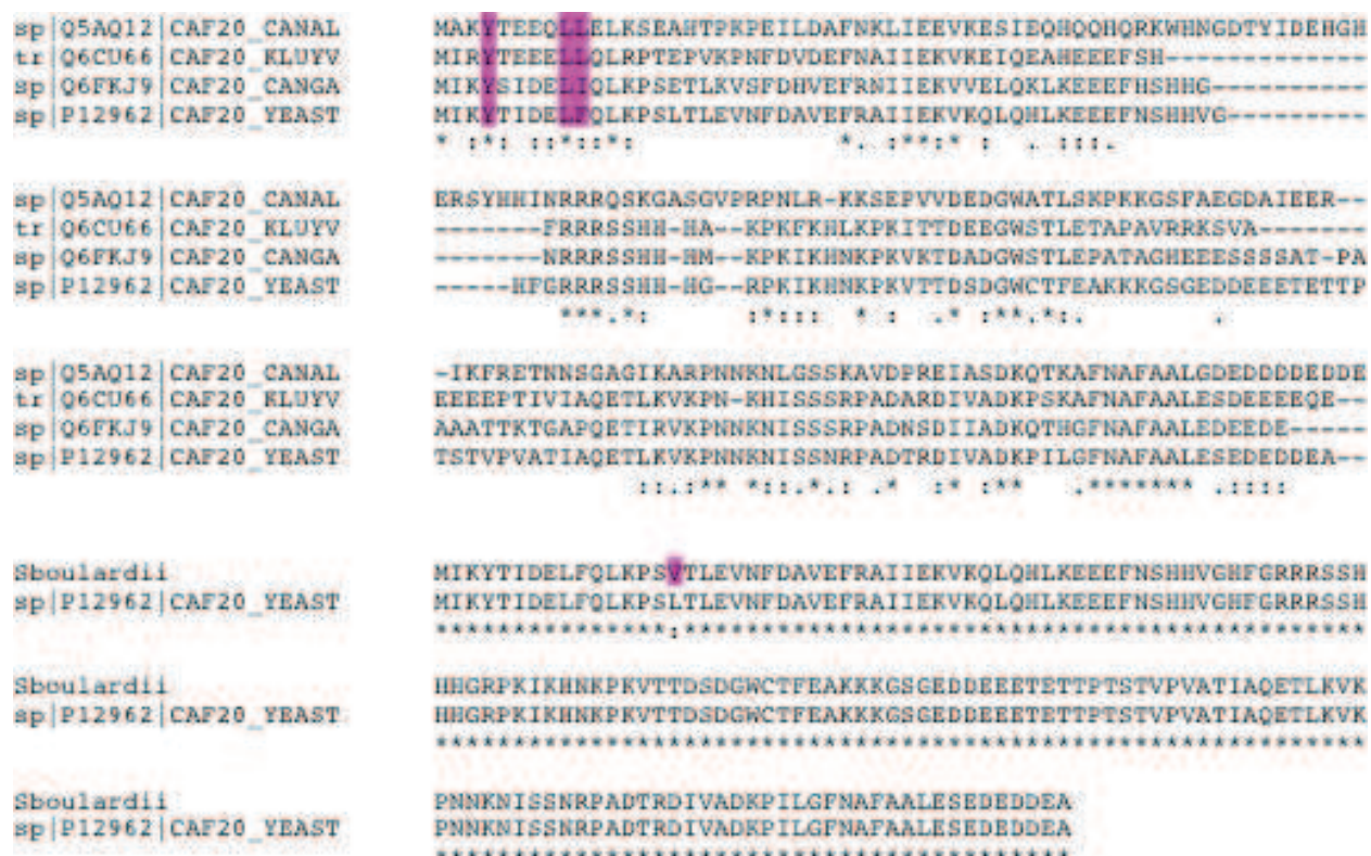
Figure 3. Sequence comparison of p20 from different yeast species. Multiple sequence alignment of p20 from different yeast sources (CANGA, Candida glabrata ; KLUYV, Kluyveromyces lactis ; CANAL, Candida albicans ; YEAST, Saccharomyces cerevisiae ) was done with the help of Clustal Omega ( http://www.ebi.ac.uk/Tools/msa/clustalo/ ). Highlighted amino acids; see text. For sequencing of S. boulardii p20 gene, the complete ORF and adjacent sequences were PCR-amplified with oligonucleotides used for S. cerevisiae p20 gene amplification and the obtained PCR product was sequenced in both directions (shown is the part encoding the p20 open reading frame of S. boulardii ).

The CAF20 gene from S. boulardii was PCR-amplified using genomic DNA and oligonucleotides hybridizing at the 5' and 3' region of the S. cerevisiae CAF20 gene. Subsequent sequencing showed that CAF20 from S. cerevisiae and S. boulardii is nearly identical. The only difference detected is a conserved amino acid substitution (leucine to valine; highlighted) at position 16 ( Figure 3 ; lower panel). Among those yeast species that carry the p20 gene conservation varies between 30 and 90% (not shown). The almost identity of both sequences shown here clearly confirms that S. boulardii is a variant of the species S. cerevisiae .