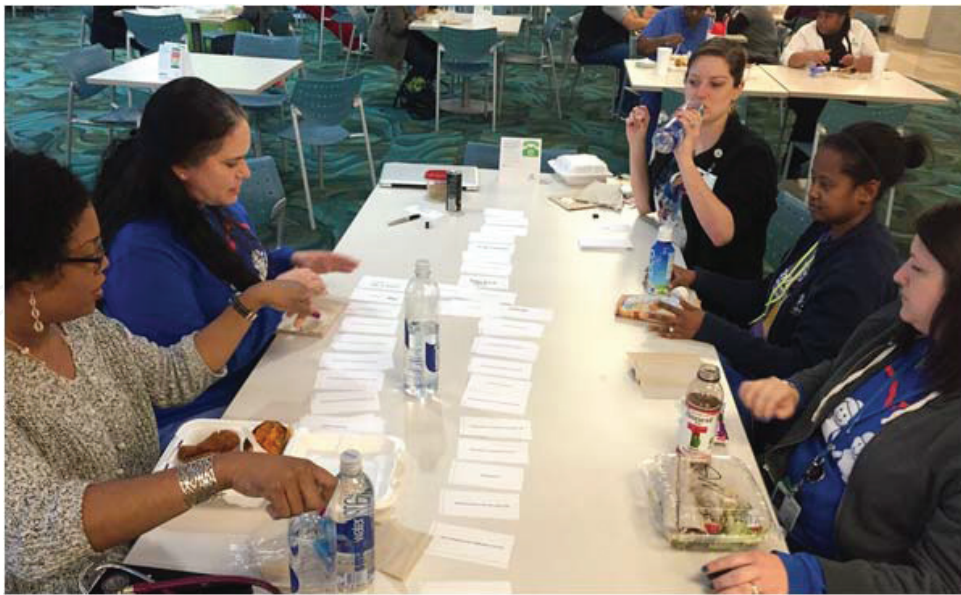
Figure 1. Expert panel card sorting exercise with four nurse practitioners and two epileptology attendings who specialized in diagnosing and treating pediatric epilepsy.

by using a single set of notecards, however, we opted to use two sets of cards to avoid having to document the cards before moving onto the second sorting session.