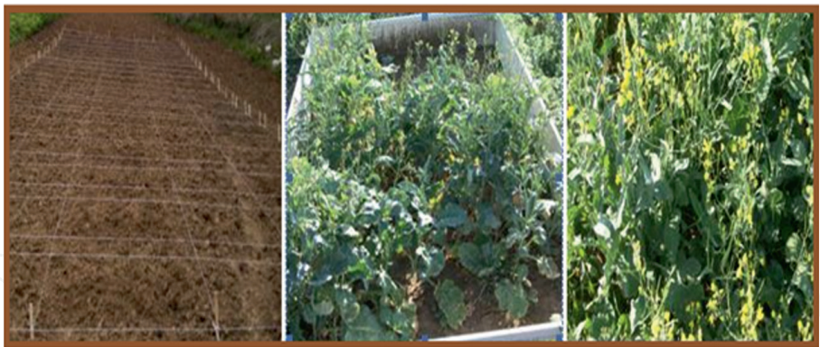
Figure 2. Different views from experiment fields (original).

The physical and chemical characteristics of the samples taken from the testing field are presented in Table 1 . According to the table, the soil’s pH is neutral, low lime and has insufficient organic matter. Its available phosphorus content is sufficient as well as the exchangeable potassium. The amount of available iron is average, available copper and manganese is sufficient, and available zinc is insufficient. Also, the testing soil is classified as clay in terms of texture [21, 22].