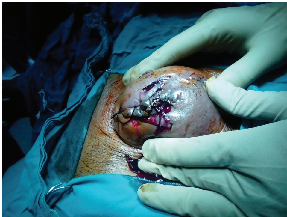
Figure 1. A badly skin stitched leaked hernia reflect the unaccepted surgeon attitude against those cases.

Hernia repair in these patients remains a procedure with a high morbidity and mortality rate if it is performed in emergency conditions due to the occurrence of complications [23].