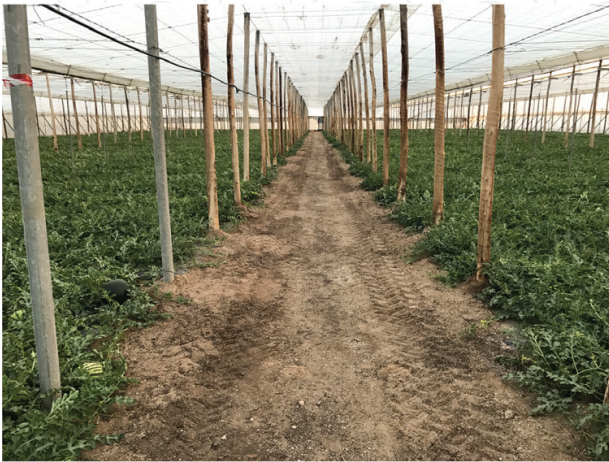
(a) Soil cropping greenhouse

so that the robot can determine the way to follow centering itself between plants. Figure 3 shows two different types of flooring, a soil cropping greenhouse and an hydroponic crop greenhouse with mulching. For both cases different umbralization values must be chosen in a manual way, so if the incorrect value is chosen by the farmer, the greenhouse corridors will not be correctly identified, and the Fitorobot will collide with the plants causing a disaster with important economic consequences. Figure 4 shows an example of segmented corridor.