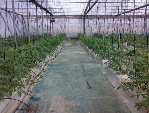
Figure 3. Different types of a greenhouses flooring.