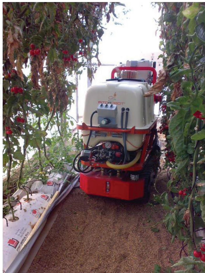
Figure 1. Fitorobot [1].

between the track centers is 0.5 m. More details about the features of this TMR can be found in Ref. [1].