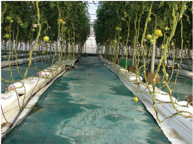
(b) Hydroponic crop greenhouse with mulching