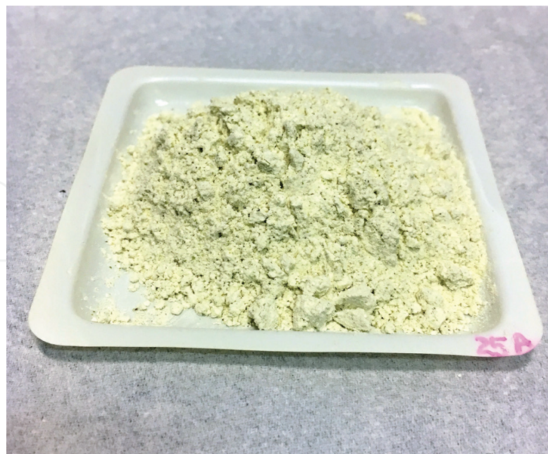
Figure 2. Cowpea flour.

In 2010, Frota et al. [66] have developed a work whose objective was to enrich bakery products, such as cookie and rocambole roulade with cowpea flour, to evaluate their acceptance and chemical composition, including the mineral content (iron, zinc, magnesium, potassium, and phosphorus) and vitamins (thiamine and pyridoxine). For this, three cookie formulations containing 10, 20, and 30% of cowpea flour and two rocambole formulations containing 10 and 20% of the flour were developed. It was observed an increase in the protein content of the cookie with 30% and of the rocambole with 20% of cowpea flour and the amount of