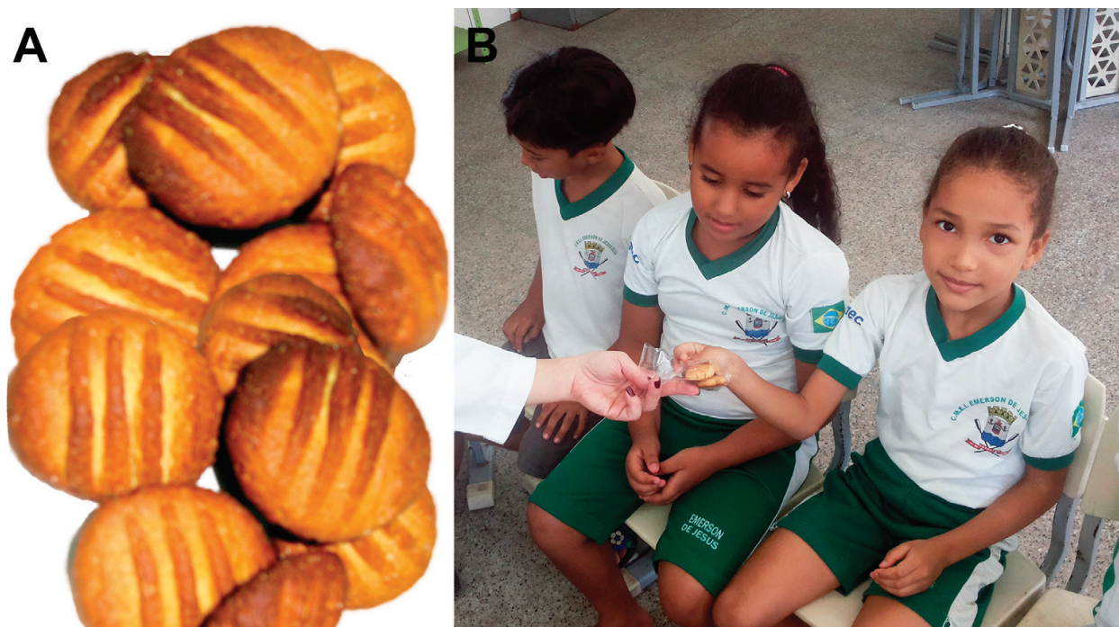
Figure 4. Cookie enriched with cowpea flour of the biofortified BRS Xiquexique cultivar and intervention with preschool children.

to the most vulnerable groups such as children. Drug supplementation has been shown to be effective, but still presents a considerable degree of resistance to the use by children and mothers. Food fortification/enrichment is routinely practiced in several countries and has contributed to reduce the prevalence of anemia, but the biofortification of food as the cowpea, which is produced in countries in Africa and Latin America, including Brazil, where the prevalence of anemia is high, deserves attention because it can be used in the usual form of ingestion (in the form of grains), can be used in the form of flour in the preparation of products for children, with greater acceptance by them, constituting a new and promising strategy to reduce the levels of iron deficiency anemia.