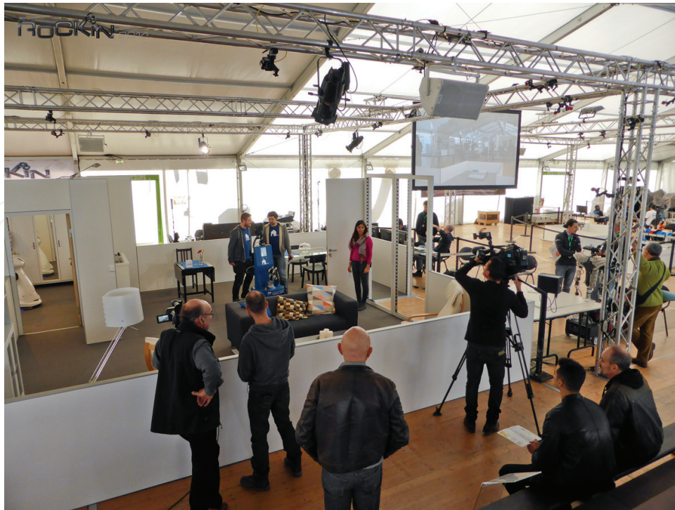
Figure 1. A view of the RoCKIn 2014 venue, showing the arenas and a press visit.

Section 5, and they include scoring methods and metrics to evaluate the performance of robot systems, benchmarks, test beds designed as a standard reference, and rulebooks following the best practices in scientific robot competitions. The chapter closes with Section 6 on the project impact and lessons learned, as assessed by the project team but also by its external advisors. This chapter provides a work plan for future research triggered by robot competitions, including novel results on benchmarking, formal languages to describe competition rules objectively, dashboards for visualization of the robot state, and robot competitions as a cradle for open innovation.