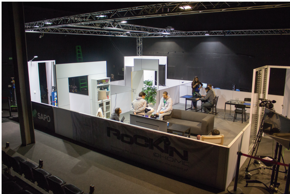
Figure 2. RoCKIn@Home test bed, including the trusses for the MCS cameras on the right.