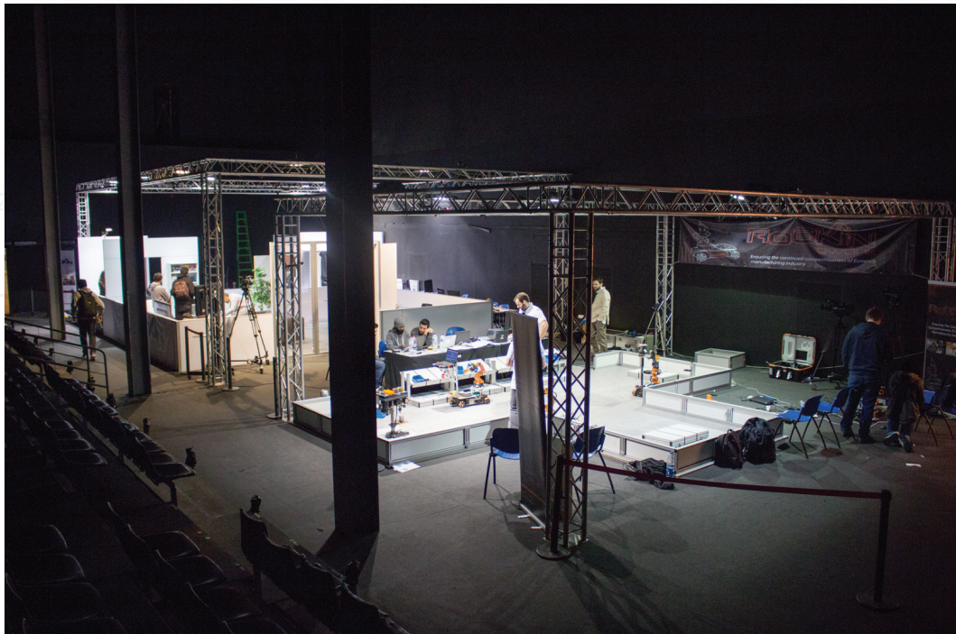
Figure 3. RoCKIn@Work test bed, including the trusses for the MCS cameras on the right.