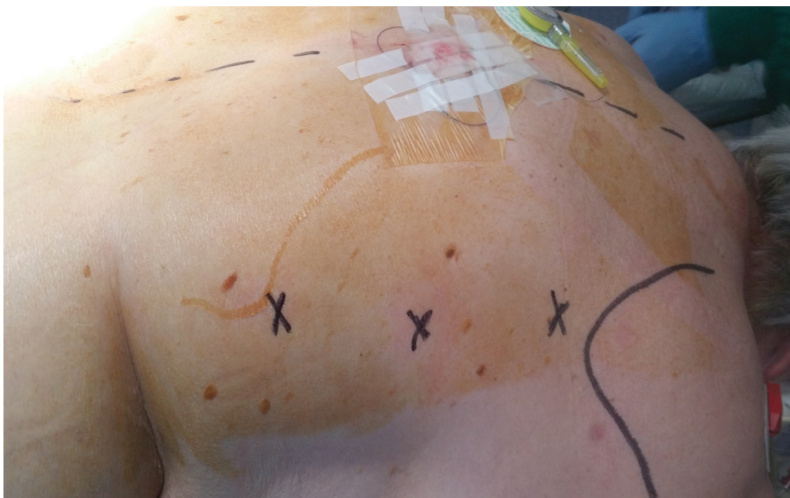
Figure 1. Thoracic trocar position on the right chest for thoracoscopic esophagectomy.

Pneumothorax is created and the insufflation pressure must be maintained at 6–8 mmHg. A single retracting suture in the diaphragm could be used to provide downward traction allowing good exposure of the distal esophagus, although in most occasions this is not necessary.