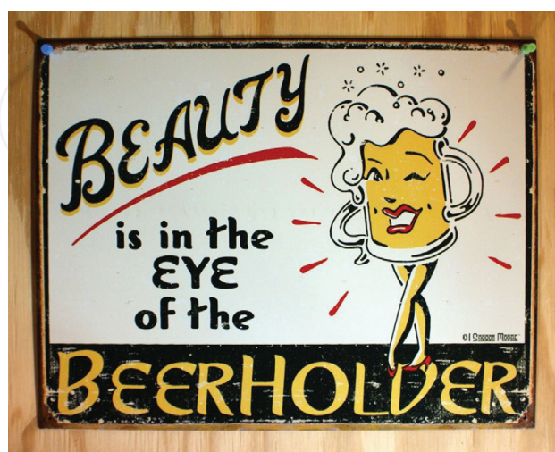
Figure 1. Behavioral studies indicate that emotion can have an effect on perception of surroundings, including visual processing. A positive mood enhances peripheral vision and increases the extent to which the brain encodes information encouraging positive, novel thoughts and actions (Commercially available plaque in author’s collection).

For some, statements such as “beauty is in the eye of the beholder” and “perception of beauty that is in the eye of the beholder” are clichés. However, in plastic surgery, central to patient management, procedure planning, and execution is the recognition that everyone has a different perception of beauty. Implications of this perception and related research range from practical everyday activities (e.g., ability to get a job) to the artistic, political, and philosophical realms. For plastic surgeons, trends and perceptions of beauty characteristics (especially extreme) that become favored and those that tend to fade away provide challenging practice templates for daily work. The exact neural mechanisms of beauty perception are unclear; it is known that surroundings and one’s mood (including professional) may have a direct effect on visual processing ( Figure 1 ).