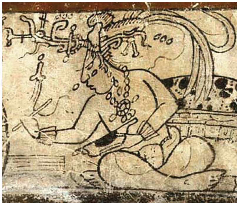
Figure 2. Yum Kaxx, God of Maize. (Public domain; unknown Maya artist—Francis Robicsek: The Maya Book of the Dead. The Ceramic Codex , University of Virginia Art Museum (1981)).

The perception of beauty has transformed through time and across the globe during specific events in history. In the late 1400s and early 1500s, after Christopher Columbus made landfall in the New World, Indians who had not been exposed to any eastern culture were found to have a completely different perception of beauty. For instance, The Mayan concept of beauty was influenced by many of their religious beliefs. “Yum Kaxx,” the maize God, persuaded the Mayan’s attraction for an elongated head and the implementation of primitive procedures to modify physical aspects of their newborns ( Figure 2 ). Trepanning, for example, was a process used by parents to flatten their newborn babies’ soft skull, facilitating their cranial transformation into elongated heads. Interestingly, cross-eyed deformities have never been thought of as a particularly desirable trait in European culture but in ancient Mayan culture, being cross-eyed was admired. In fact, like cranial shape modification, Mayans would also