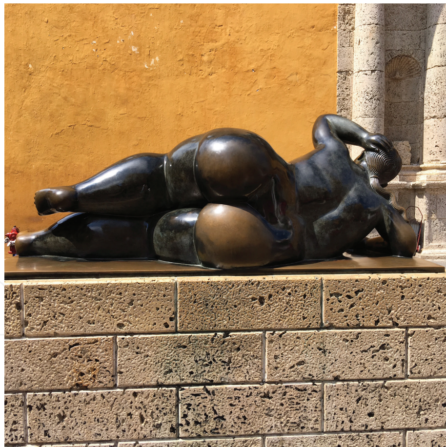
Figure 5. Fernando Botero's sculpture with exaggeration of curvy buttocks. Emphasis on the female buttocks as a sexual characteristic has recently increased, upper female torso (breast, shoulders) give way to the lower, perhaps perceived as more erotic, area of the body, specifically buttocks. The question arises whether the fashion (tight, accentuating hips, jeans) plays a role in this change (Old Town Cartagena, Colombia. Photograph by the Author).

Our studies on facial and gluteal features are random examples on how profiling and stereotyping can lead to inaccurate assumptions in cosmetic surgery. They denote that scientific analysis can assist the surgeon in preoperative counseling. It also influences in learning and managing patient expectations and helps to optimize the choice in tools for beautification. The use of evidence-based medicine to approach the design and execution of cosmetic surgery is practical and helpful in codification of technical guidelines ( Figure 6 ).