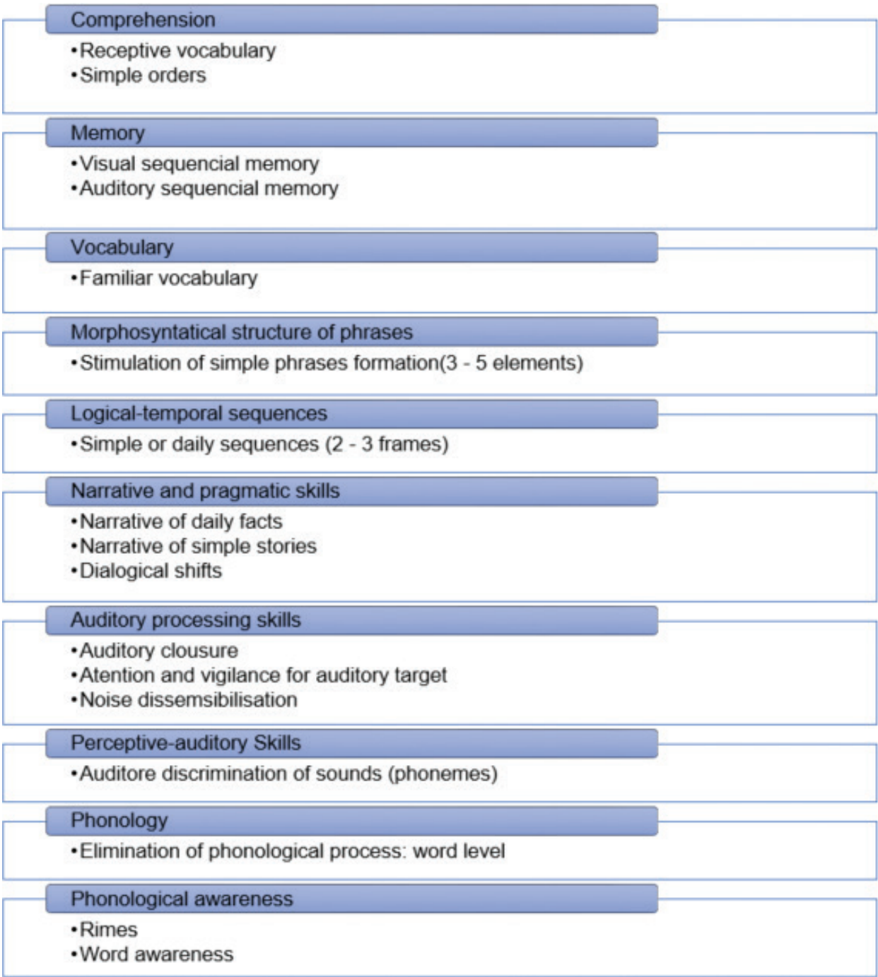
Figure 2. Specific objectives for Level I language stimulation goals of the ELO program.

Children with difficult to understand orders, mainly complex and segmented, presenting lack of oral or speech intelligibility, quite compromised (speech garbled, several phonological processes), presenting deficits in receptive vocabulary, and pragmatic abilities.