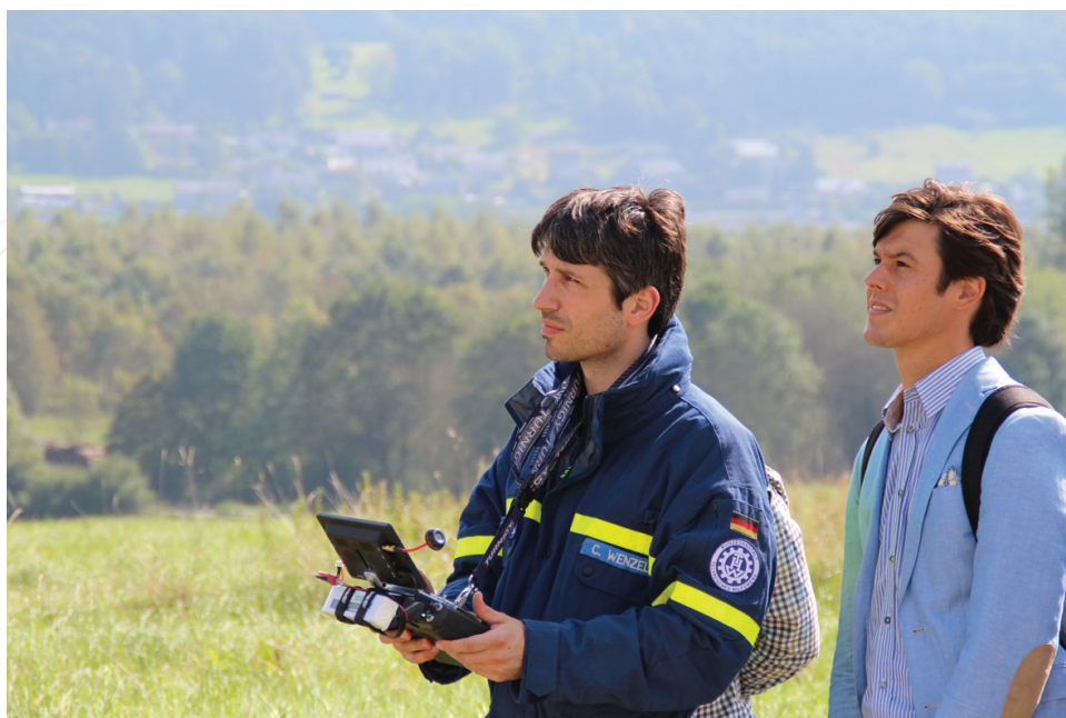
Figure 7. End user controlling ICARUS unmanned aerial system (source: ICARUS consortium).

Simulated crisis response exercises are extremely useful, but the real operational validation of unmanned technology in search and rescue missions can only be done in a real-life operation. Therefore, the ICARUS team did not hesitate when ICARUS partner B-FAST was deployed to Bosnia in 2014 to help with flood relief operations after massive inundations to send along an expert in robotics and an unmanned aerial system (see also [9] and Chapter 10). The mission was highly successful, providing assistance on the crisis sites not only for several international relief teams [B-FAST, Technisches Hilfswerk (THW), ...], but also for the Bosnian Mine Action Centre (BiHMAC). Figures 10 and 11 show how these relief teams were brought into contact with the new technological tool, provided by ICARUS, in collaboration with the