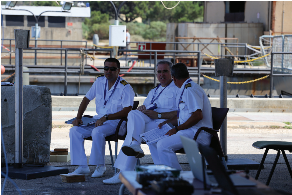
Figure 9. Expert Navy officers evaluating the performance of the ICARUS marine tools.