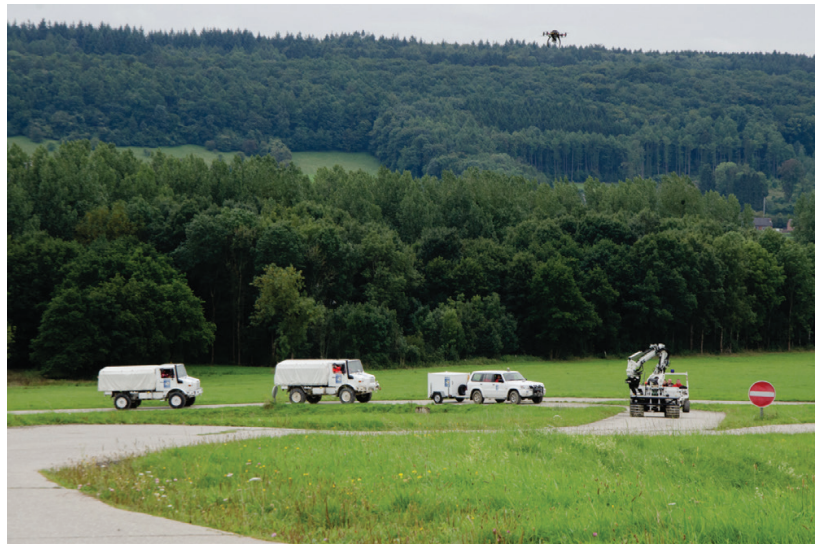
Figure 4. Fast deployment test.