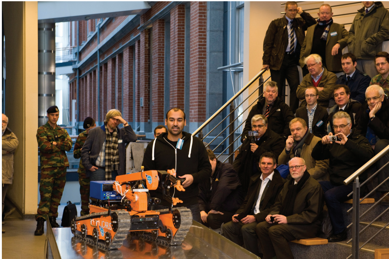
Figure 3. ICARUS small unmanned ground vehicle demonstrated during the first European unmanned search and rescue end users' conference.

Each of the validation scenarios introduced above contains a detailed scenario, which is aligned with the timeline for the demonstrations. Furthermore, each validation scenario contains a list of capabilities that need to be validated, corresponding to system requirements for the different tools. Finally, each validation scenario also includes a score sheet with a number of metrics that are used to quantify the performance of the tools during the operational validation tests. Using this methodology, it is possible to validate the degree to which each of the system requirements has been attained.