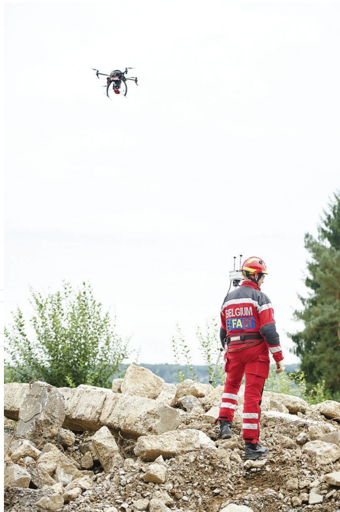
Figure 5. Collaboration between aerial rescue robots and human rescue workers.