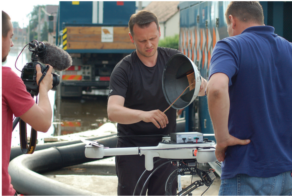
Figure 10. Collaborator of the Bosnian Mine Action Centre being trained during operation on the use of unmanned aerial systems for mine risk mapping.