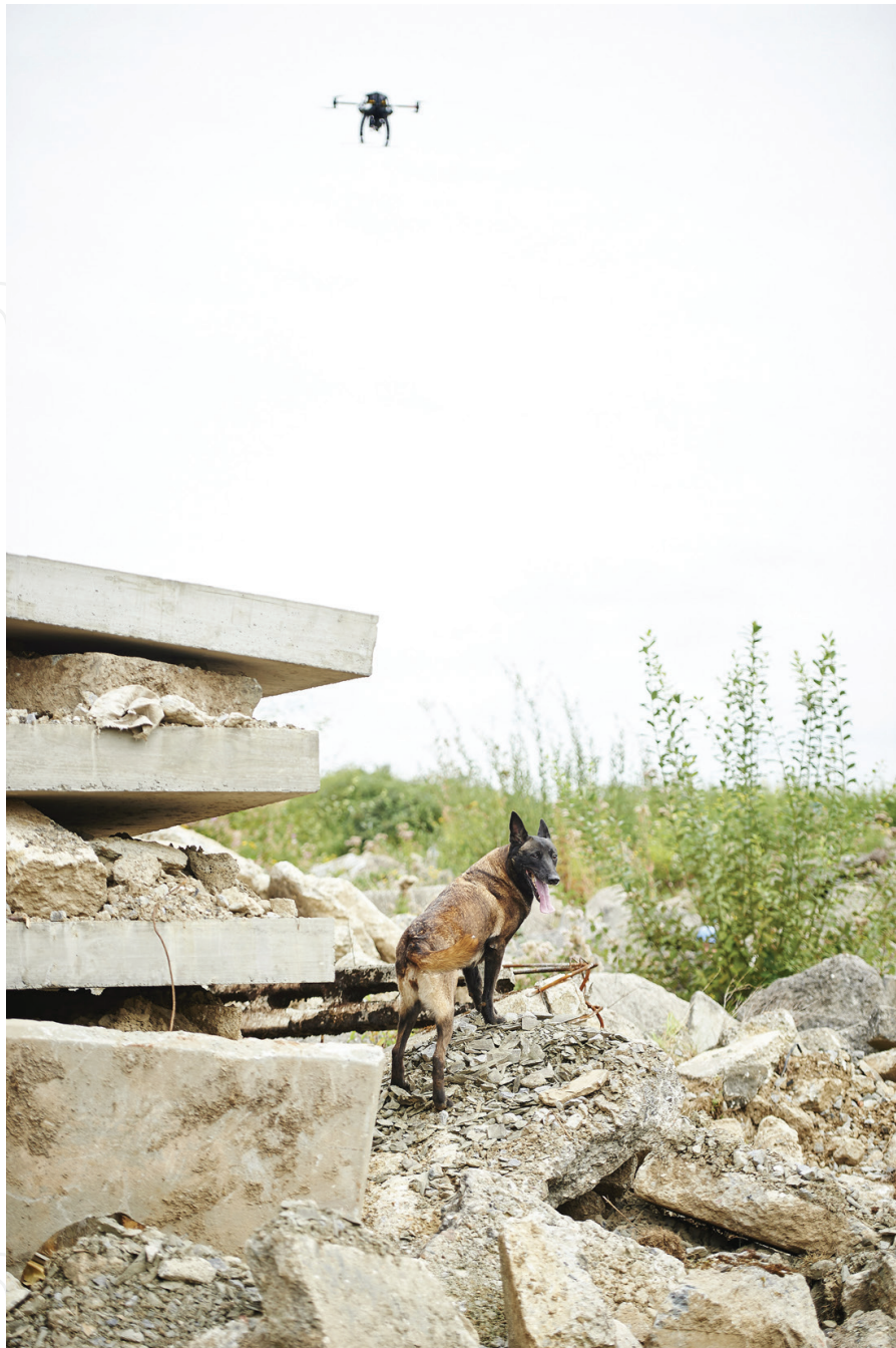
Figure 6. Collaboration between aerial rescue robots and canine rescue assets.

the (ultrasound) noises made by aerial robots). This trial turned out to be very successful and showed that dogs and aerial search teams are not only capable of working side by side, but that they are complementary tools, as the dogs were very capable in locating victims hidden on or under the ground in demolished buildings, whereas the aerial tools were very capable of locating victims trapped at a higher level (e.g., on rooftops).