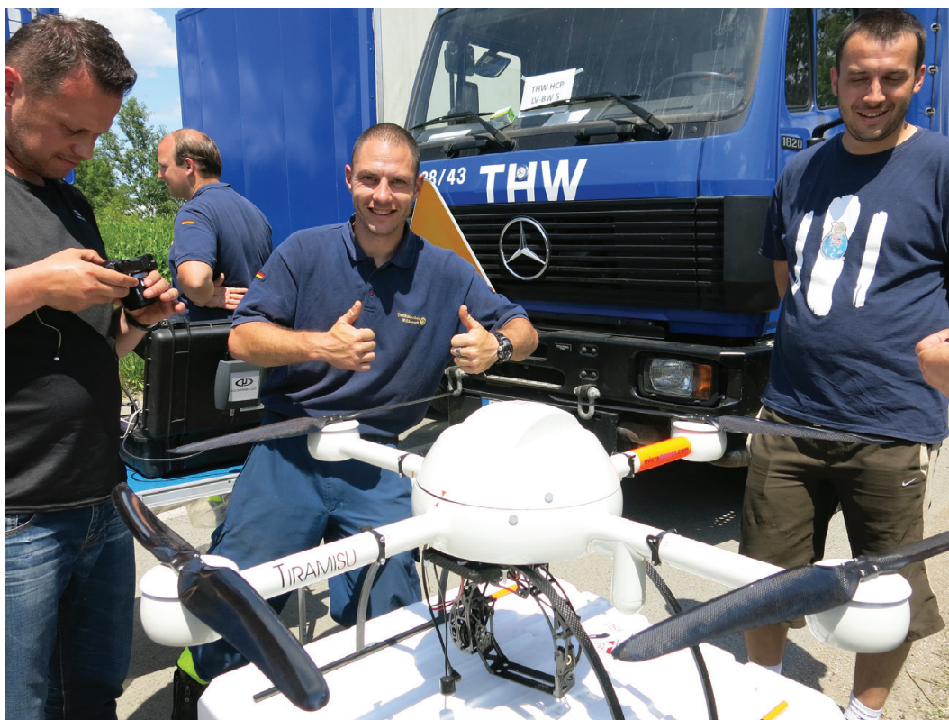
Figure 11. Operatives of the German relief team “Technisches Hilfswerk” (THW) being trained during operation on the use of unmanned aerial systems for damage assessment (source: ICARUS consortium).