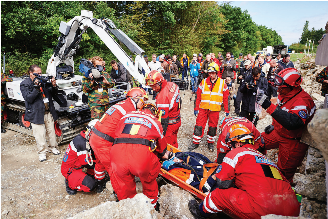
Figure 8. Safe collaboration between human search and rescue workers and heavy robots.