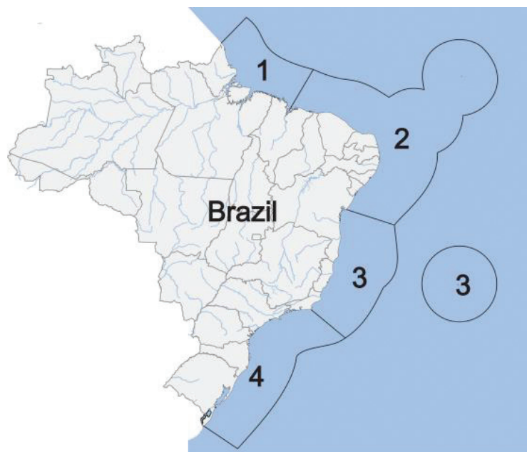
Figure 2. South America and Brazilian coastline as identified by the REVIZEE Program: 1. Northern Coast, 2. Northeastern Coast, 3. Central Coast and 4. Southern Coast.

Records published in scientific literature, unpublished master and doctoral thesis or simply reported in scientific meetings (abstracts and proceedings) and project reports were also considered as reliable sources of information.