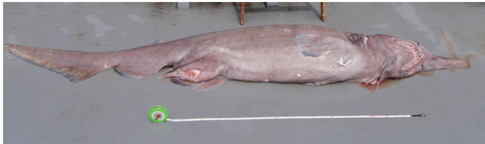
Figure 5. Mitsukurina owstoni male specimen with 3152 mm TL captured off Rio de Janeiro in 2008.

Schroederichthys saurisqualus and S. tenuis : The recently described catshark S. saurisqualus is endemic to southern Brazil with higher captures between the states of Paraná and Rio Grande do Sul. This species presents no economic value and is discarded on board [15]. S. saurisqualus is commonly captured by trawlers, longliners and even gill nets in waters deeper than 200 m ( Figure 4 ). The slender catshark S. tenuis is endemic to the northern coast and has occasional catches on the continental slopes of the states of Amapá and Pará [28, 37, 88]. Both species were captured during the research surveys of the REVIZEE Program and their population impact due to deep-water fishery is currently unknown, but their high endemism level is an additional component of concern.