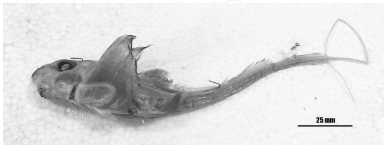
Figure 7. Specimens of H. matallanasi captured by commercial fleet on the continental slope of Santa Catarina.

Chimaeriforms (Holocephali: Chimaeriformes) are known in Brazil as “quimeras” and this designation includes rabbit fish, elephant fish, longnose chimaera, and all other species of this group. Four recognized species, one putative species and one unidentified species are recorded as follows: Callorhynchus callorhynchus (Linnaeus, 1758), Hydrolagus alberti (Bigelow and Schroeder, 1951), Hydrolagus matallanasi (Soto and Vooren, 2004), Harriotta raleighana (Goode and Bean, 1895), Hydrolagus cf. mirabilis (Collett, 1904) and Rhinochimaera sp. The American Elephantfish C. callorhynchus was the first chimaera identified and included in Figueiredo’s [105] catalog of species of the state of São Paulo. This species is occasionally recorded along the continental shelf during winter months from the states of Rio Grande do Sul to São Paulo always in small numbers and captured by otter trawl or gill net. All other records are typical deep-water species, but only H. matallanasi [29] is frequently captured and reported on REVIZEE reports [52, 97], and bycatch monitoring programs [15, 58] ( Figure 7 ).