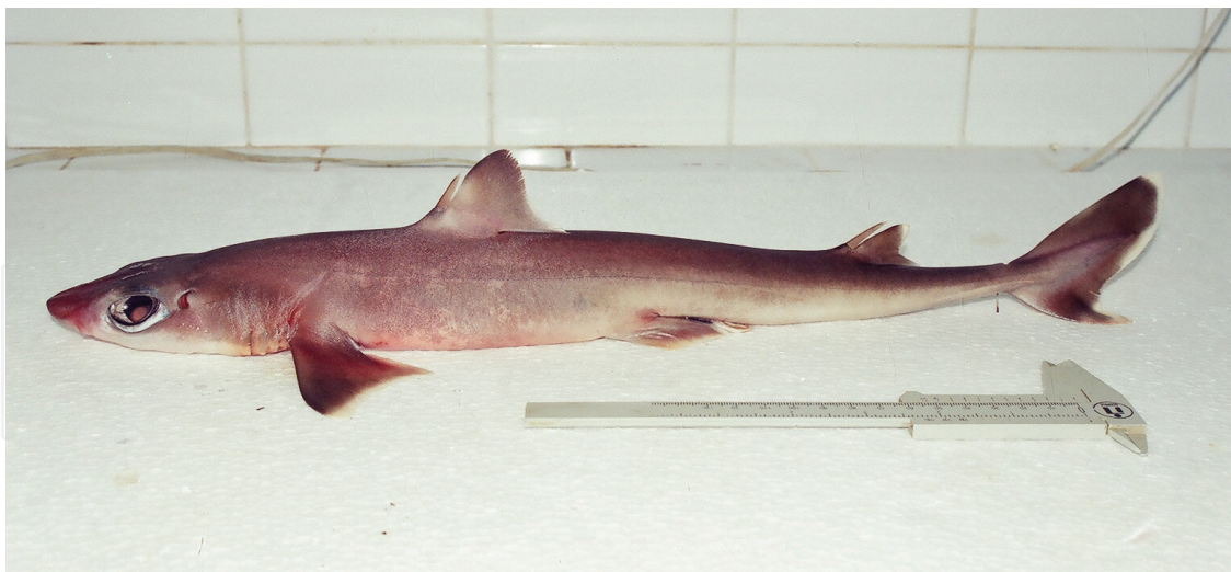
Figure 3. Specimen of Squalus cf. albicaudus captured off the northeastern continental slope along the REVIZEE program.

These large captures suggest that it is likely that these species will become commercially exploited in the near future [45].