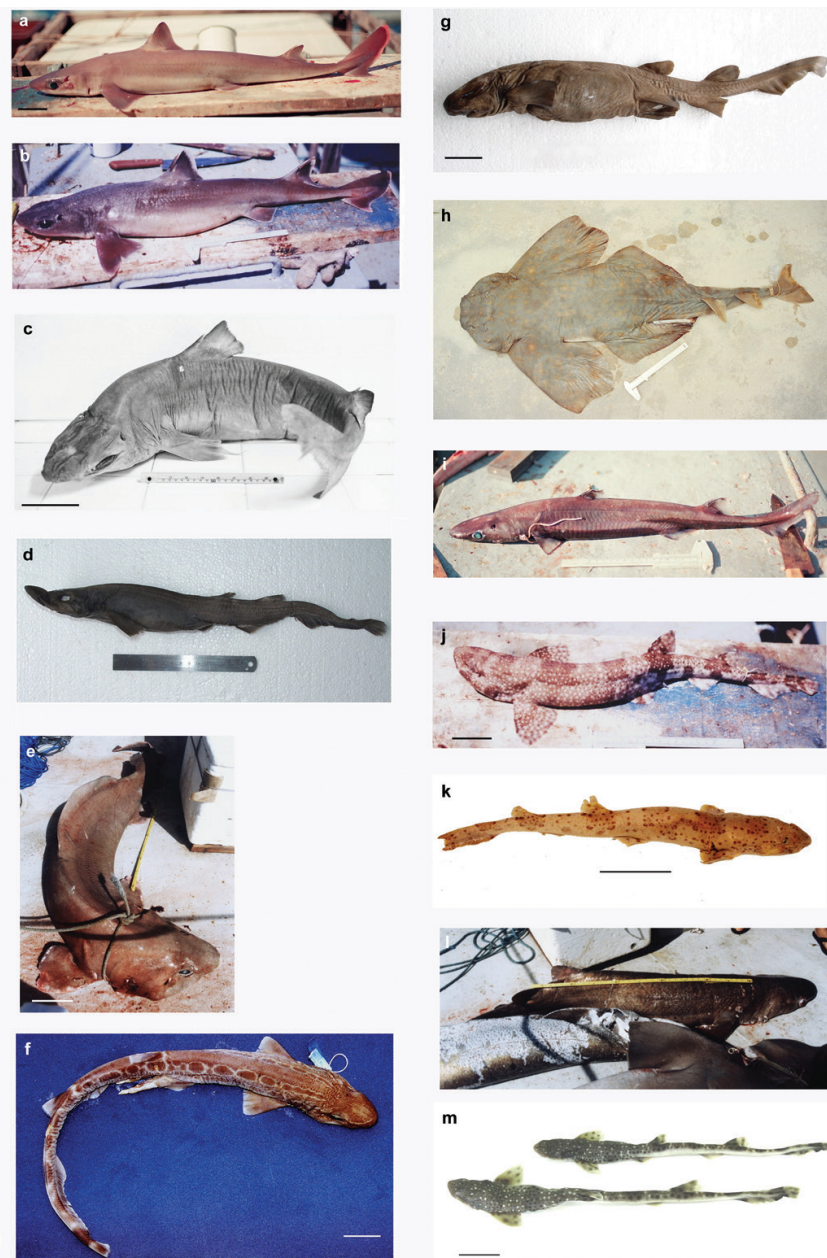
Figure 4. Deep-water sharks and respective scale references: (a) Squalus cf. albicaudus , 20 mm; (b) Cirrhigaleus asper , 150 mm; (c) Centrophorus granulosus , 100 mm; (d) Apristurus parvipinnis Springer and Heemstra 1979, 150 mm; (e) Pseudotriakis microdon , 300 mm; (f) Galeus mincaronei , 20 mm; (g) Parmaturus cf. campechiensis , 40 mm; (h) Squatina sp. A, 150 mm; (i) Etmopterus bigelowi Shirai and Tachikawa 1993, 150 mm; (j) Scyliorhinus ugoi , 40 mm; (k) Scyliorhinus haeckelii (Ribeiro, 1907) (holotype MNRJ-494), 60 mm; (l) Echinorhinus brucus , 1000 mm; and (m) Schroederichthys saurisqualus Soto 2001, 50 mm.

specimen (female 1040 mm TL, the smallest of all captured animals) [27, 28, 38]. All other specimens were discarded without further scientific analysis. More recently in 2008, a large mature male (3152 mm TL and 99 kg total weight) was captured in depths of 700–1000 m off the state of Rio de Janeiro by a chartered boat for deep-water shrimp ( Figure 5 ) [39].