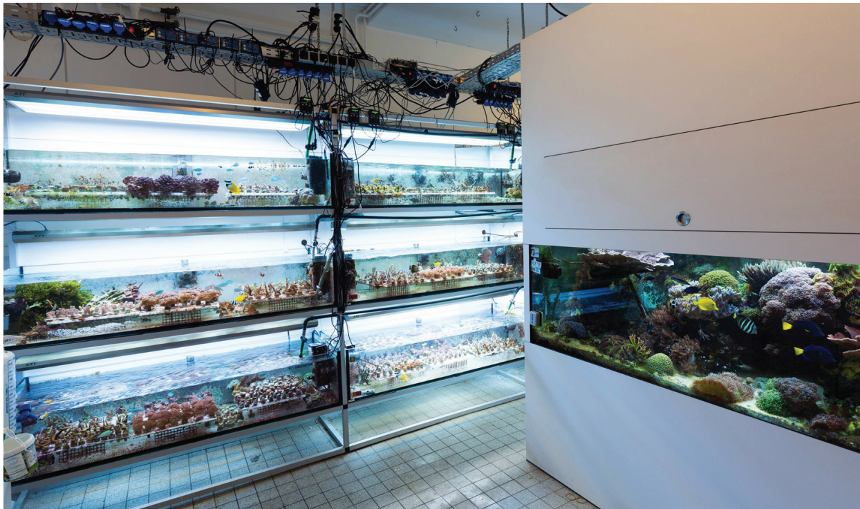
Figure 1. 'Ocean 2100' global-change simulation experiment at Justus Liebig University Giessen. Nine experimental coral tanks (three hidden) are connected via a technical tank (not shown) to a 'buffer' reef tank with live rocks and a deep-sand bed (right). This long-term setup (intended duration 10 years) has been designed as an open microcosm system with synthetic seawater and a single water-circulation system. The replicate system (not shown here) has its own water-circulation system and 'buffer' tank.

the experiment. In fact, the longer the duration of the experiment, the more detailed planning is needed. Unless natural seawater of high quality is readily available or the composition of its natural microbial community is of interest, synthetic seawater is favoured in microcosm experiments. In that case, high-quality products should be preferred and whole packages must always be used for preparing the water [17, 25]. Moreover, important parameters (e.g. pH, alkalinity, salinity) have to be checked prior to use. Closed coral-microcosm systems are typically only applicable for short-term experiments (over few weeks) without the need for associated faunas (such as herbivorous fish). For medium-term experiments (several months) without associated faunas, semi-closed setups are preferable. Long-term experiments (several years) or setups that require supplementary food supply are typically designed as open microcosm systems ( Figure 1 ). For semi-closed and open setups, a seawater exchange of at least 20% per month is recommended [28]. As for the water-circulation systems in coral microcosms, the least number with the largest effective volume should be chosen for each experimental system (for a review of the statistical needs in global-change experiments, see [18]).