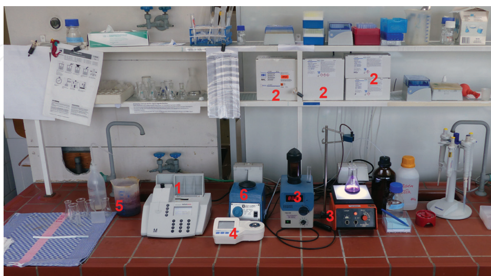
Figure 4. Laboratory workplace for seawater analyses. (1) Photometer, (2) test kits, (3) titration device with illuminated stirrer, (4) digital refractometer, (5) container for waste water and (6) lab shaker.

If nutrients in the system are removed via a skimmer/water-flow-through system, skimmer size and water-circulation rates need to be adjusted carefully. As a rule of thumb, a 100-L tank requires a water-circulation rate of at least 300 \text{ L} \cdot \text{h}^{-1} . If nutrient levels in the system need to be increased, particularly in long-term experiments, the use of carefully selected associated fish species might be less risky and achieves better results than the addition of extra nutrients. Special filter systems for nutrients, which are frequently used in fish aquacultures, are not recommended for coral-microcosm systems as accidentally released substances (e.g. \text{H}_2\text{S} or \text{NO}_2^- ) may jeopardize the entire system.