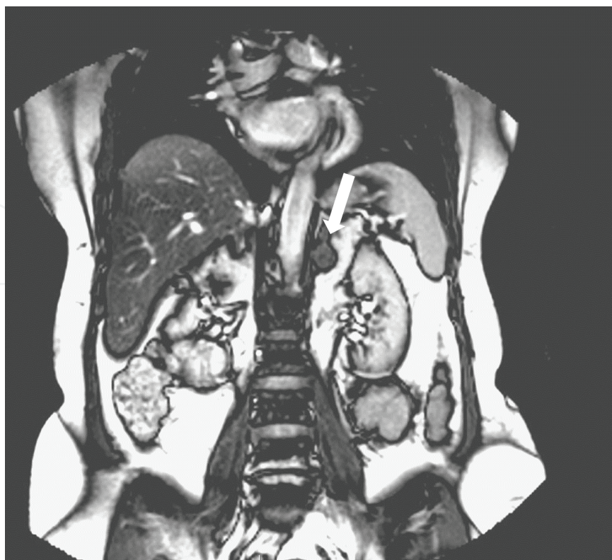
Figure 5. MRI: left adrenal cortical adenoma.