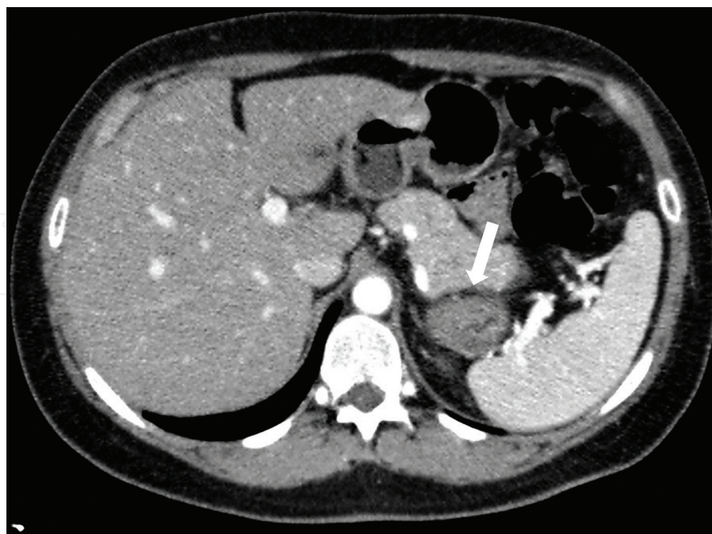
Figure 6. CT: left adrenal incidentaloma.