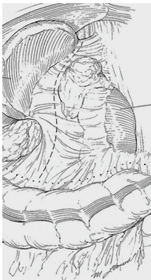
Figure 2. Laparoscopic exposure of left adrenal gland: mobilization of the spleen and tail of the pancreas and dissection of left colonic flexure.