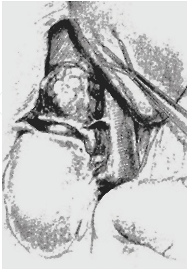
Figure 3. Laparoscopic exposure of right adrenal gland: mobilization of the liver, identification of short right adrenal vein—partial retrocaval position of the right adrenal gland.