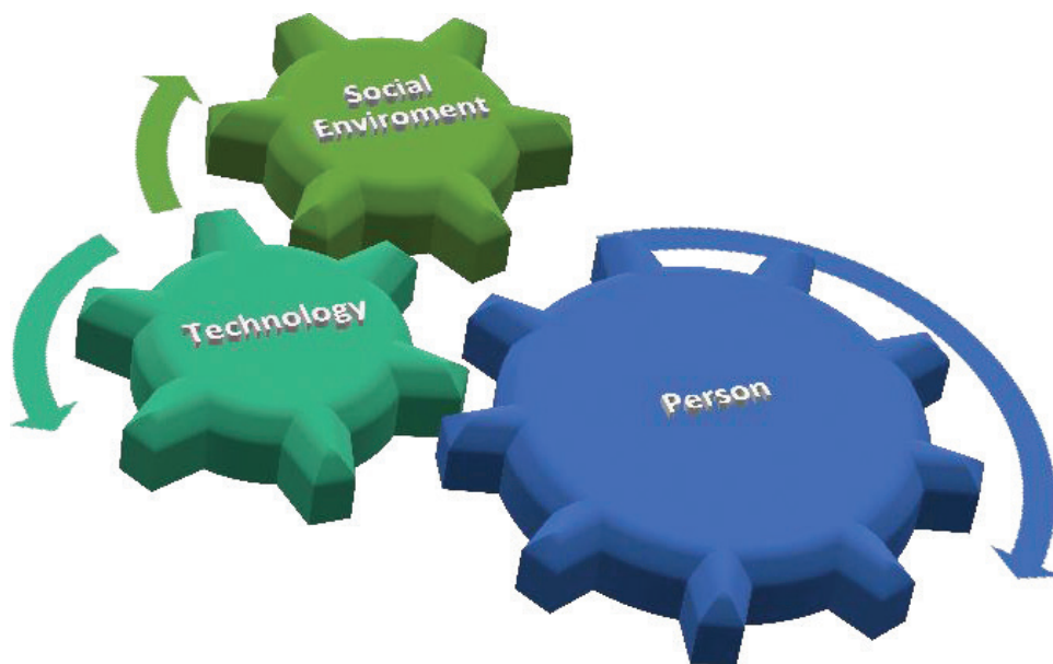
Figure 2. The dynamic relationship between person, social environment, and technology.