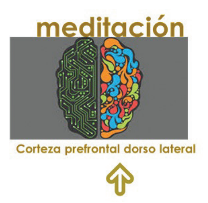
Figure 1. Effects of meditation. Prefrontal cortex lateral dorsum. Own elaboration.