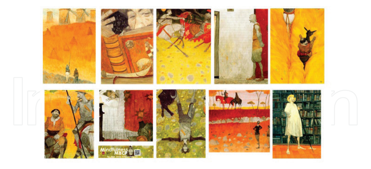
Figure 2. Composition of the 10 pieces analyzed in the application of our MBCP research. Own elaboration.