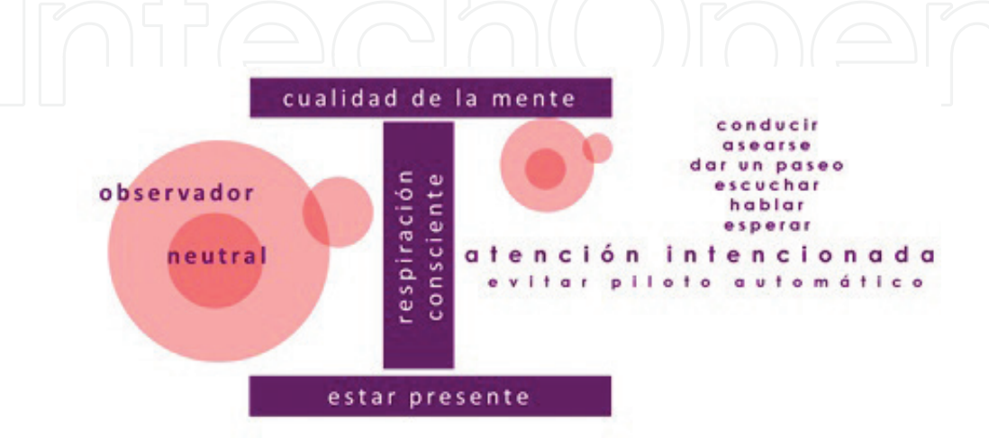
Figure 3. Graphic composition of the concept of Mindfulness. Own elaboration.