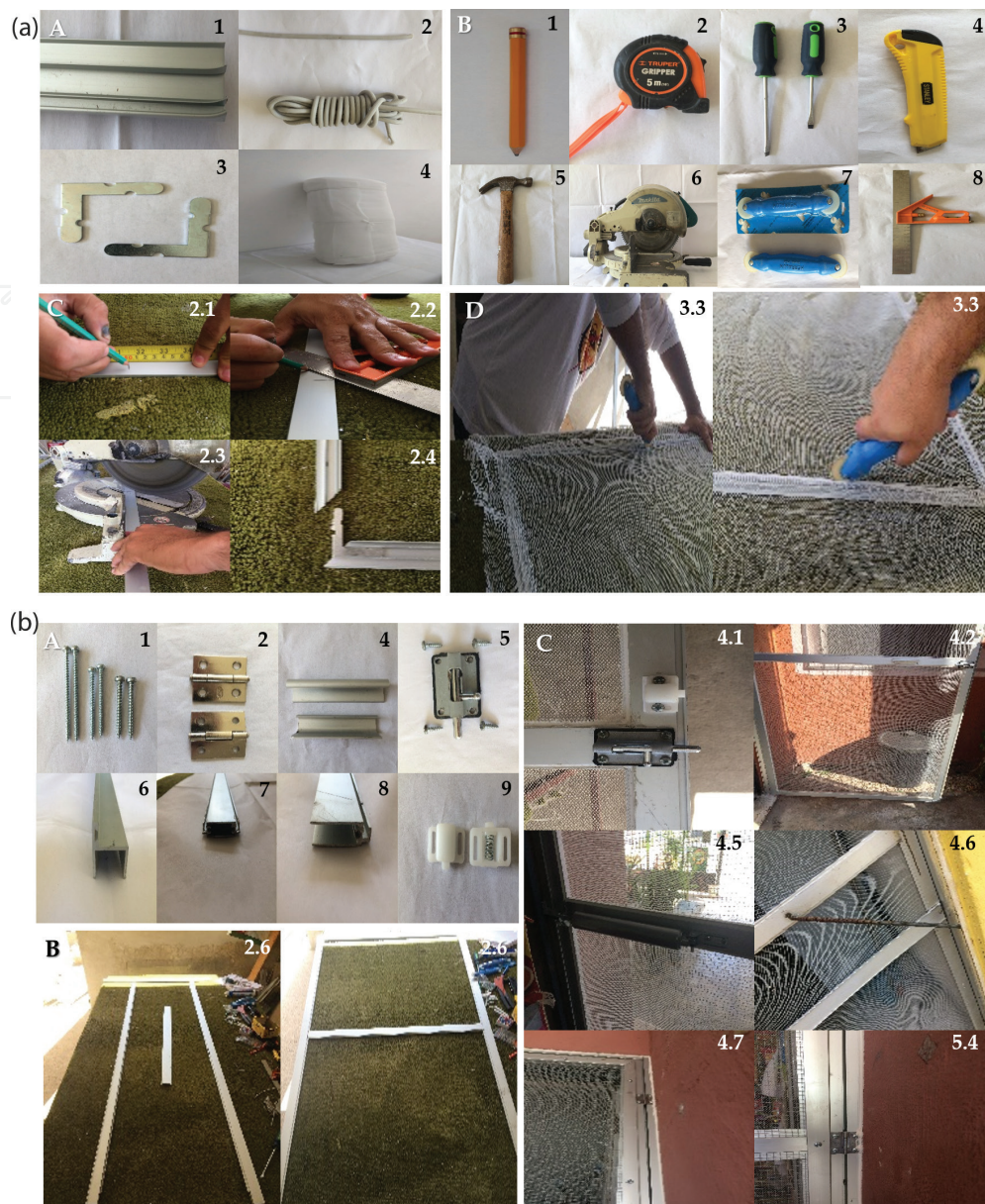
Figure 2. General description of how to install insecticide-treated screens on windows and doors. Window: (A) Materials required: (1) screen frame, (2) square for screen frame, (3) vinyl #12 and (4) window screen. (B) Tools required: (1) pencil, (2) measuring tape, (3) screwdriver, (4) sharp knife, (5) hammer, (6) hacksaw, (7) convex wheel and (8) universal square. (C) Step 2: (2.1) Using a measuring tape and pencil, make a mark where a cut is to be made on the new frame. (2.2) With the universal square, mark a 45° angle on the first mark of the final measure. (2.3) Use the hacksaw to make the 45° cut. Make four cuts, one on each side of the window. (2.4) Use squares to join the four parts of the frame. Insert squares into the frame along the side with 45° cut and lightly tap the squares into place. Check the assembled frame for squareness. (D) Step 3: (3.3) With the help of the convex wheel, insert the screen into the channel with vinyl, beginning at one corner (press down and roll with short strokes back and forth). When all sides have been inserted into the vinyl, remove the excess vinyl. Door: (A) Materials required: (1) screws (1 ½ × 8", ½ × 8, 1 × 8), (2) hinges, (3) vinyl # 12, (4) elephant trunk handle, (5) hasp, (6) chair butt, (7) mosquito door frame central, (8) mosquito door frame vertical and (9) lock. (B) Step 2: (2.6) Forming the door, 1 ½ × 8 screws should preferably be used. Step 4: (4.1) The lock and pin are installed in the central part of the frame, at the appropriate distance for its correct operation. (4.2) The elephant trunk handle is installed in the central part of the frame. (4.5) Spring allows the automatic closing of the door. (4.6) Pivot allows the automatic closing of the door in a slow and controlled way. (4.7) Metal mesh protects the mosquito net from damage caused by animals. Step 5: (5.4) Fix the door to the frame using ½ × 8 screws, a drill and a screwdriver. Check the assembled door for squareness.