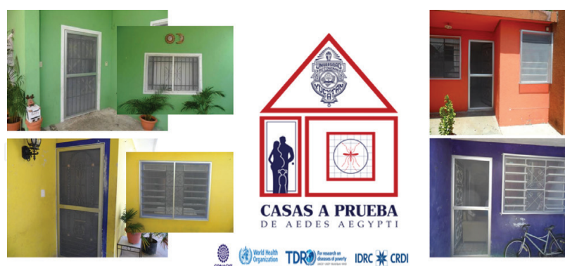
Figure 1. Photographs show Aedes aegypti -proof houses with insecticide-treated screens mounted on aluminium frames and fixed to external doors and windows of treated houses.

The intervention called Aedes aegypti -proof houses ('Casas a prueba de Aedes aegypti ') involves insecticide-treated screening (ITS) with the use of long-lasting insecticidal nets (LLINs) permanently fitted to windows and doors to exclude A. aegypti , vector of dengue, chikungunya and Zika (Figure 1).