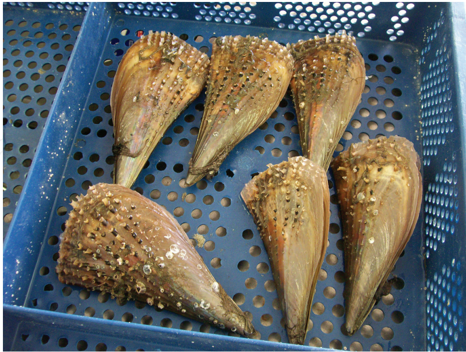
Figure 1. Atrina maura procured from the bottom culture at San Buto estuary in Baja California Sur, México [20].