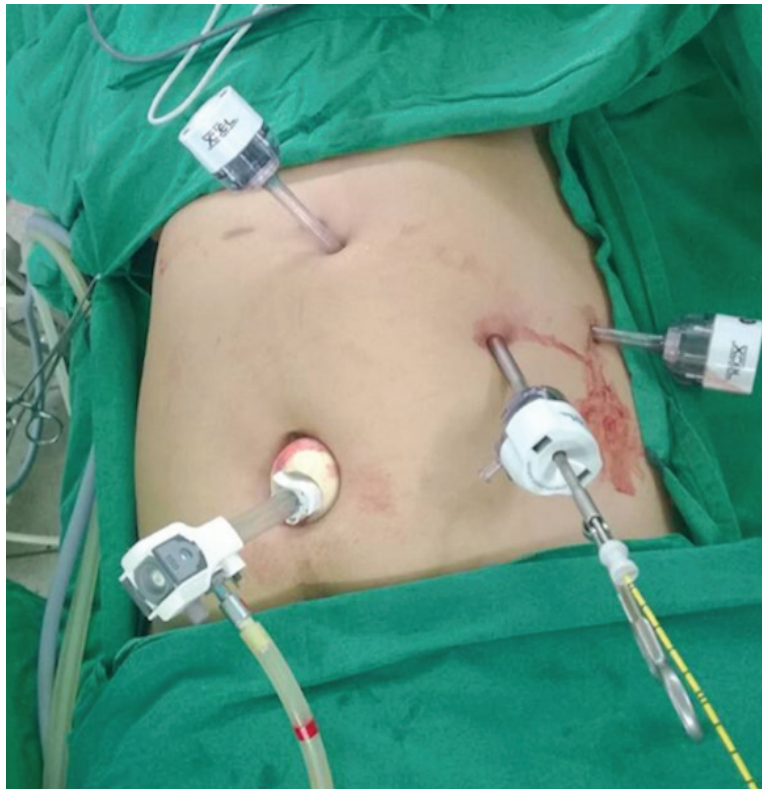
Figure 3. Cystic duct identification.

surgeon. They placed a 12-mm sub-umbilical camera port, a 10-mm epigastric port, and a 5-mm left subcostal port to perform successful laparoscopic cholecystectomy [38]. In 2010, Eisenberg described a four-port technique using a “mirror image” port placement technique for ordinary laparoscopic cholecystectomy. A 12-mm camera port was inserted at umbilicus, a 5-mm port was inserted at epigastrium, and two 5-mm additional ports were placed along left subcostal line. The left-handed surgeon performed dissection through the epigastric port. However, most surgeons are right-handed dominant. They have always some troubles, such as “sword fighting” between both hands and difficulty for dissection using a nondominant hand. In 2016, Phothong et al. reported the four-port technique of LC for right-dominant surgeons. The operative equipment, surgeon’s position, and port placement were prepared as “mirror image” to the routine laparoscopic cholecystectomy. The surgeon was positioned on the right side of the patient with situs inversus. They placed the left midclavicular port 5 cm caudally from left costal margin. The right-handed surgeon could perform the dissection by the dominant hand through this port with a more ergonomic position. This resulted from increased working space around Calot’s triangle and decreased “sword fighting” situation [39].