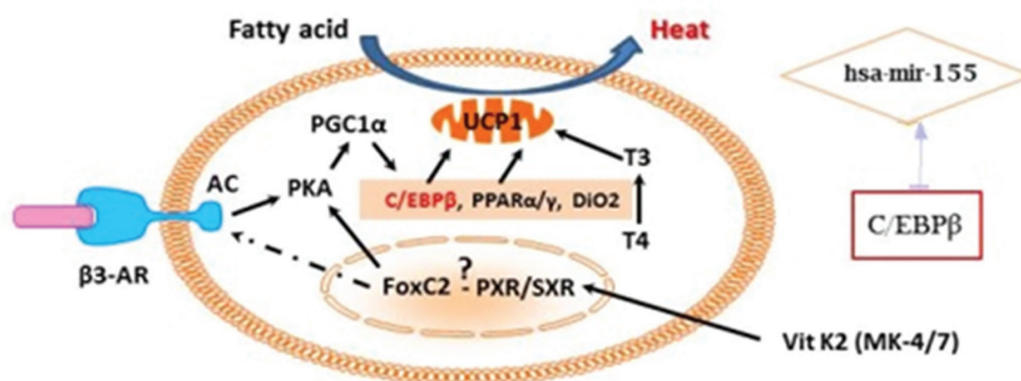
Figure 2. Putative model system featuring the mechanism behind the impact of vitamin K2 (MK-7). Based on previously published consensus material, our new findings of the effect of vitamin K2 (MK-7) shows that K2, via binding to the transcription factor PXR/SXR affects several signaling molecules and/or pathways, via the \beta_3 -adrenergic system, impinging on signaling molecules like PKA, PGC1 \alpha , C/EBP \beta , and Dio2, which eventually affects the activity of the uncoupling protein UCP1, which produces heat (and not ATP) from fatty acids. Not mentioned in the text is the reciprocal regulatory loop consisting of the microRNA species hsa-mir-155 and the transcription factor C/EBP \beta , which can be manipulated to reinforce the “beige” phenotype of the adipocyte after differentiation from the stem cells or preadipocytes.

Interestingly, C/EBP \beta , which is connected to a mitochondrial miR-155 in a reciprocal regulatory loop (verified via the Mir@nt@n algorithm) may prove to be important in this process