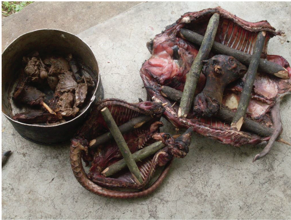
Plate 1. Exhibits of Atherurus africanus (African brush-tailed Porcupine) and other animal species.