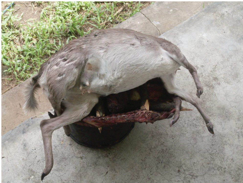
Plate 2. Exhibits of Philantomba monticola (female blue duiker).