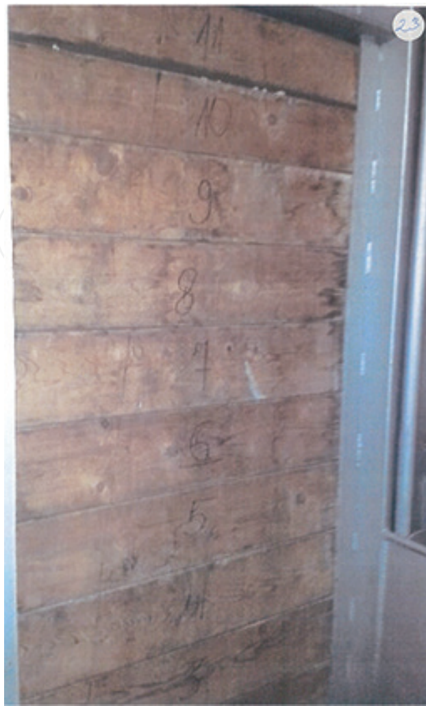
Figure 4. The plank barrier seen from the lashing equipment room. Wood pellets in the cargo hold are visible between planks 10 and 11. The barrier is evidently not gastight. (CORINA).

In line with the International Maritime Solid Bulk Cargoes (IMSBC) Code, the shipper had declared the hazardous nature of the cargo. The wood pellets were declared as a group B cargo and marked as Materials Hazardous only in Bulk (MHB), which covers materials that may possess chemical hazards when carried in bulk. The shipper had provided several safety recommendations, only allowing entry to the cargo hold after 2 h of natural ventilation and measurements of oxygen content and dangerous gasses, carbon monoxide included.