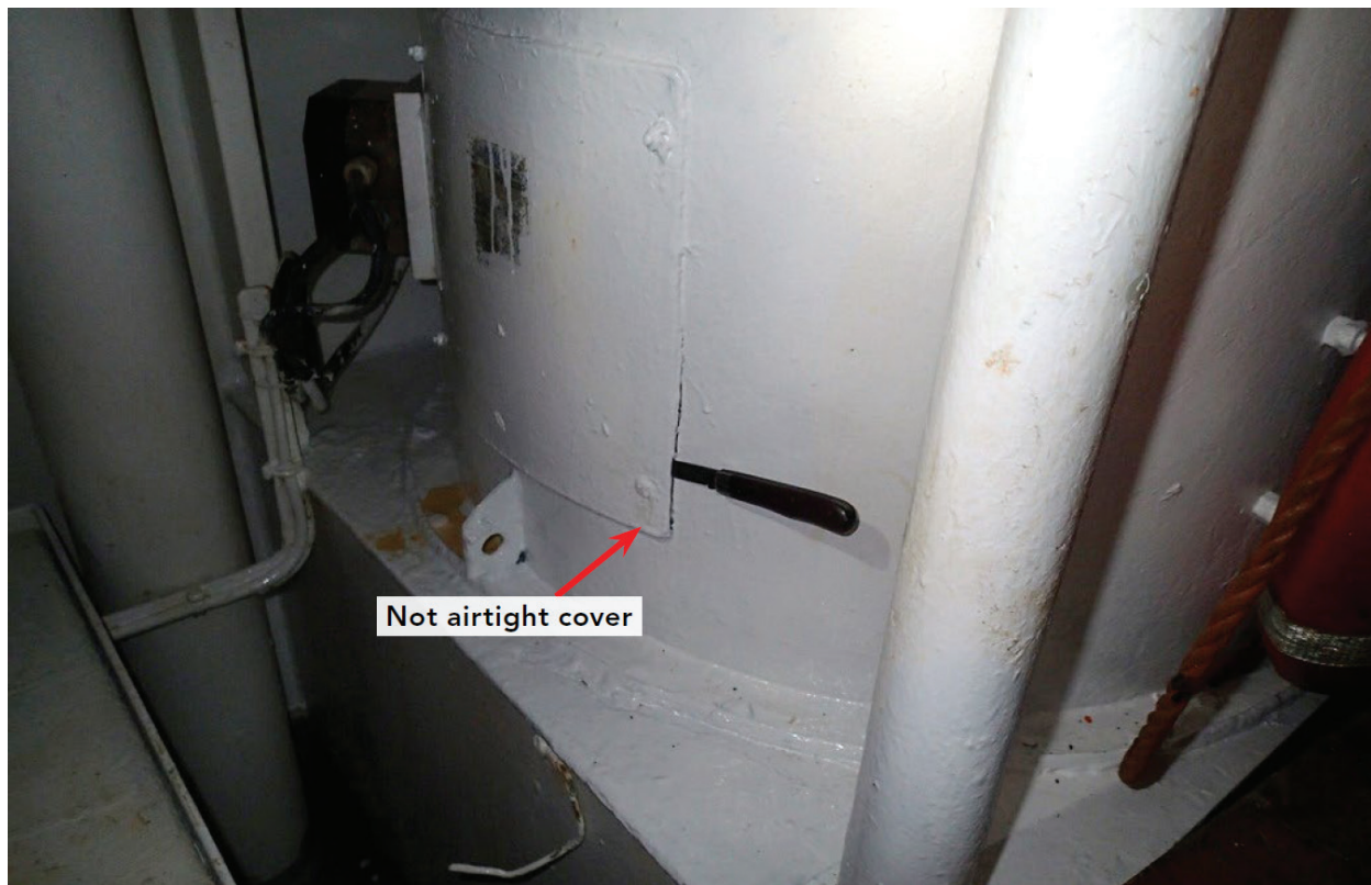
Figure 2. The inspection hatch on a ventilation duct that ran from the cargo hold through the forecabin. A minor gap in a section of the rim (knife blade inserted) allowed gasses to travel from the cargo hold to the bow area. (LADY IRINA).

In response to the fatal accident, the shipping company acquired multi-gas meters and introduced a new work procedure mandating that the person making “First Entry” must carry an operational multi-gas meter. New warning placards with the instruction “ATTENTION—No first entry without use of multi-gas meter” were been put up on access doors.