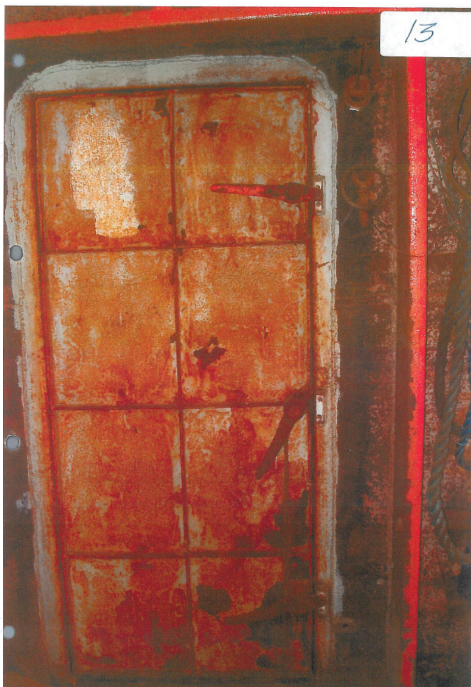
Figure 1. The door in the forepeak compartment, which led the front cargo hold. The door had three closing hinges but only two were engaged. Gasses travelled from the cargo hold to the forepeak through a crevice where the third hinge was not engaged. (AMIRANTE).

The crew was at pains to explain why the two seamen would go down the forepeak. They had no business down there whatsoever. It was suggested that they might want to check if there was sufficient room for stowage of the old mooring ropes.