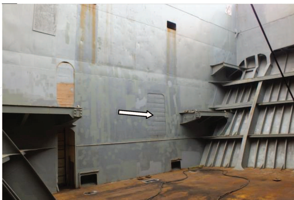
Figure 3. An opening in the front cargo hold allowed easy access to the lashing equipment room. When carrying bulk cargo, the opening was closed with planks of wood inserted into guide bars (CORINA). Source: [16].

The crew was at pains to explain why the able seaman would enter the lashing equipment room. He had no business down there whatsoever and had not requested permission or informed anybody of his intention to go there. He was supposed to be on watch near the gangway.