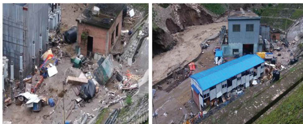
Figure 3. Flooding washed way Bhotekoshi Hydropower Project, July 6, 2016 4:11.

Nepal (relief) Natural Calamities Act, 1992, concerning most devastating disasters, earthquakes since 1934, 1980, 1988–2015 and summer flooding events of 1993, 2008, 2013, and 2014. The another great event of 7.8 magnitude earthquake struck Nepal on 25 April 2015 (11:56 am local time) epicenter in Barpak Village of Gorkha district, 81 km northwest from the capital city of Kathmandu [53]. The earthquake directly affected 14 districts with human and livestock casualties, infrastructure, and physical property. The Gorkha earthquake 2015, damaged buildings and infrastructures like road, hydropower projects, residential, and school buildings. Burial of the entire Langtang village, blocking of Kaligandaki river, damages to hydropower projects and damages to Araniko and Rasuwagadhi highways connecting to China were the major noticeable events due to the earthquake-induced landslide.