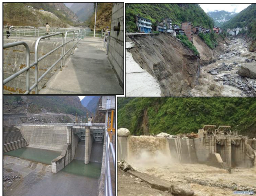
Figure 4. Impacts of GLOF of hydropower UBHP (45 MW), July 2016.

In region of the great Himalaya, 17% of the area covered by glacier and ice cover and nearly 113,000 km 2 , the total area covered by glaciers and permafrost outside the polar region. The Himalayan region has 35,000 km 2 of glaciers, and a total of 3700 km 3 ice reserve. The Himalayan region is the source of nine largest rivers in Asia where over 1.3 billion people lived. The warming in Nepal and Tibet increased progressively within a range of 0.2–0.6°C per decade between 1951 and 2001, particularly during autumn and winter. Over the past 30 years, the length of the growing season has increased by almost 15 days. The Himalayas glacier melt has increased the frequency and intensity of risks like floods, avalanches, failure of moraine-dammed lakes, and water regime affects.