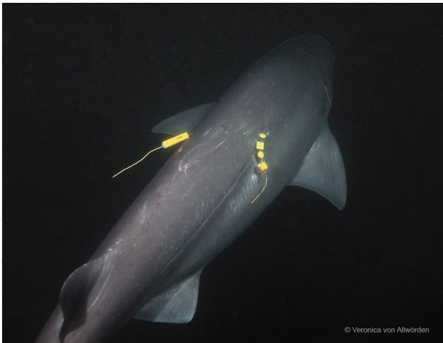
Figure 4. Free swimming sixgill shark with visual marker and acoustic tag for movement and abundance research under the Seattle Aquarium.