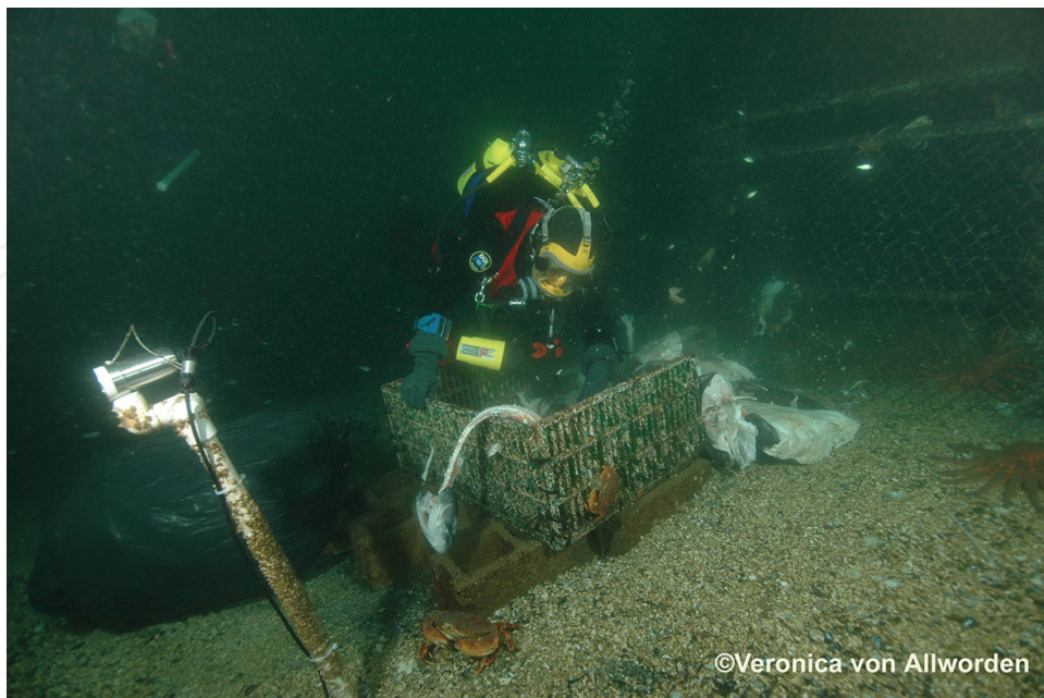
Figure 3. SCUBA diver setting bait to attract free swimming sixgill sharks at the Seattle Aquarium for genetics and abundance research.

the Aquarium Conservation Partnership (ACP) launched in 2016 as a 2-year-proof-of-concept project designed to bring the nation's leading aquariums together to achieve meaningful