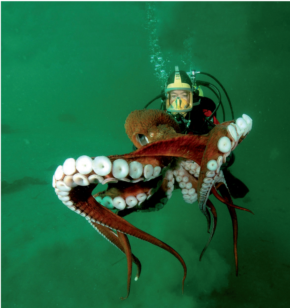
Figure 5. SCUBA diver conducting population surveys on giant Pacific octopuses.