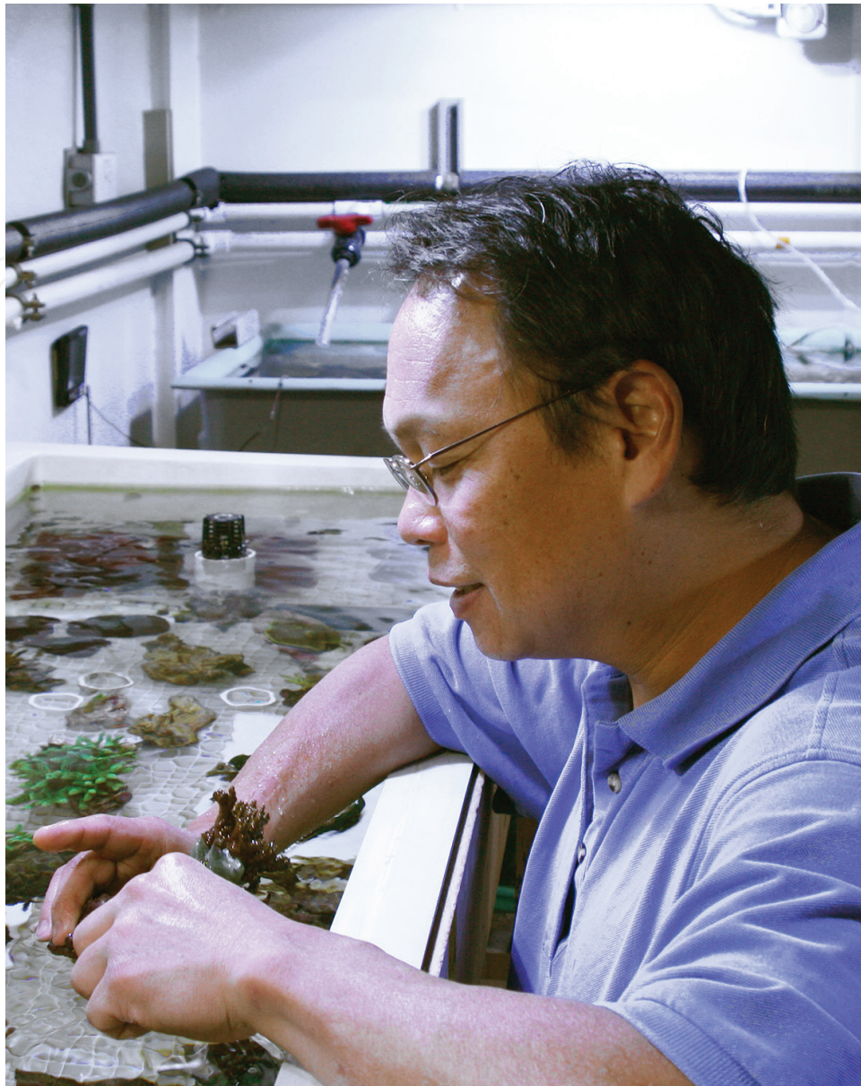
Figure 1. Coral research: Seattle Aquarium biologists growing corals for display and to share with other aquariums to minimize taking of wild corals.

Zoos and Aquariums are doing more for wildlife conservation and they may have the greatest conservation impact when they work together. In 2015 AZA launched a conservation initiative called Save Animals from Extinction or SAFE. The initiative is to encourage accredited zoos and aquariums to harness their collective resources, focus on specific endangered species, and save them from extinction by restoring healthy populations in the wild. AZA SAFE focuses on 10 signature species/groups of animals: African penguin, Asian elephant, black rhinoceros, cheetah, gorilla, whooping crane, sea turtle, sharks, vaquita, and Western pond turtle. Many of the major aquariums in Table 2 listed conservation projects that involved either sharks and/or sea turtles as many aquariums have sharks in their collections and many either have sea turtles or participate in sea turtle rehabilitation. Another collaborative conservation initiative,