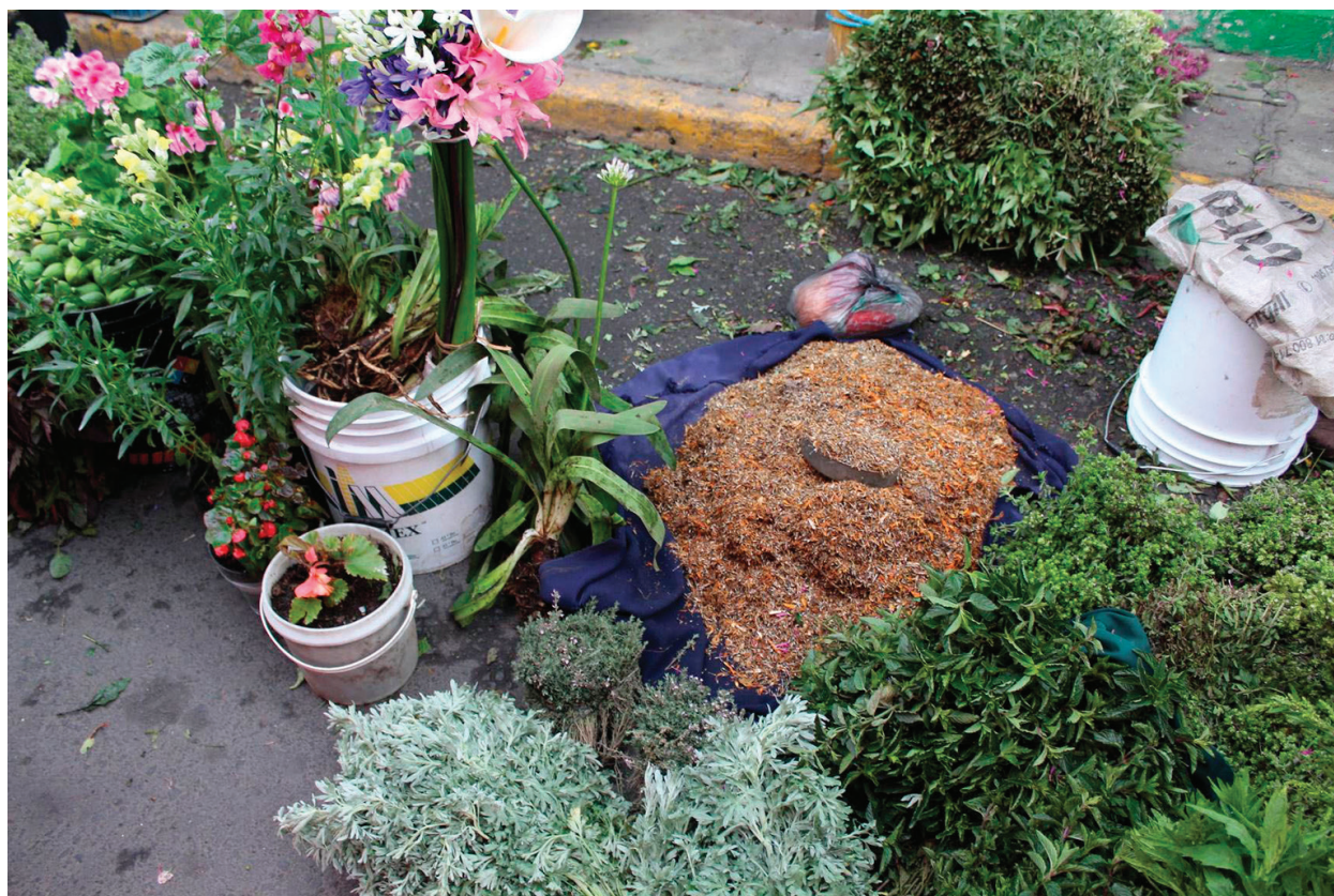
Figure 2. Trade of medicinal plants in Ozumba, state of Mexico.

F.G. Mey.), cuachalalate ( Amphipterygium adstringens (Schltdl.) Standl.), tepezcohuite ( Mimosa tenuiflora Benth), and probably other species for which reports are lacking.