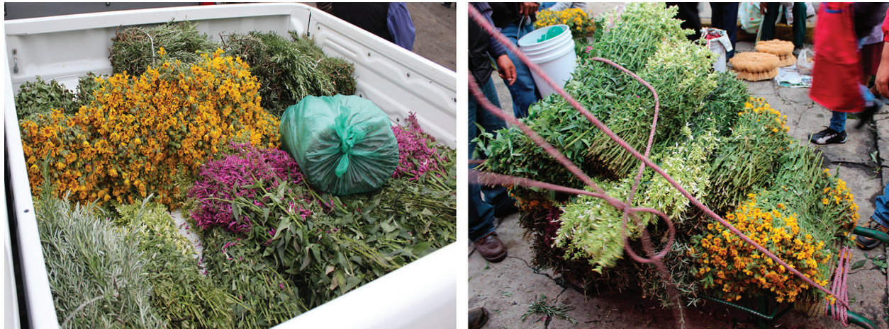
Figure 3. Trade of Mexican arnica in the market of Ozumba, state of Mexico.

country. But it is known that the most popular essential oils are Mexican oregano, sweet lime, and Mexican lime. [44].