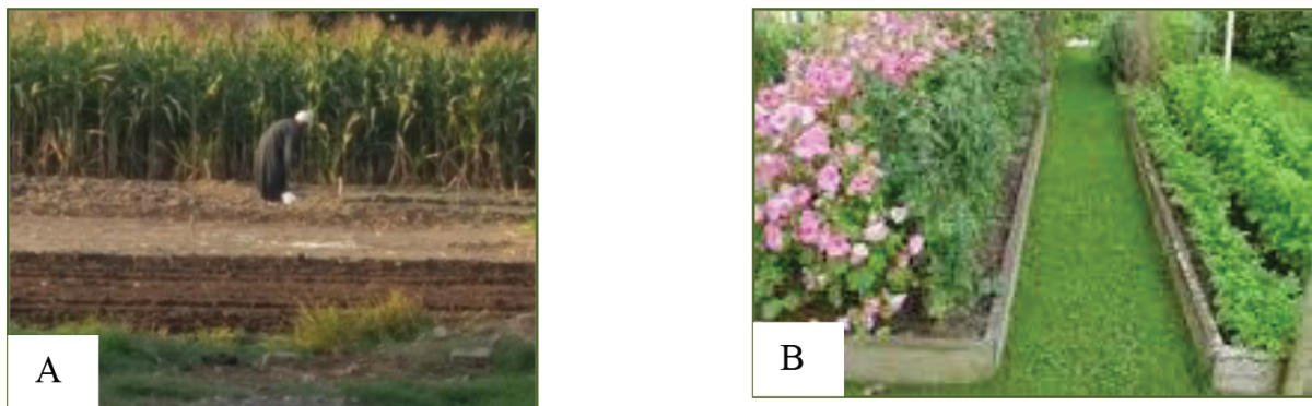
Figure 1. Complete removal of maize may eliminate natural enemies (A) or after roses cutting (B).

Figure 1. Collection and transferring of natural enemies to environmentally controlled habitats could be useful in utilizing these natural enemies until releasing them in the next crop season.