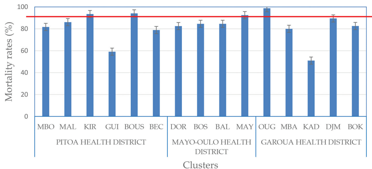
Figure 2. Mortality rates of Anopheles gambiae s.l. populations 24 h post exposure to 0.05% deltamethrin-impregnated papers. The red line at 90% mortality rate indicates the threshold below which a mosquito population is classified as resistant to the insecticide used for susceptibility test [25]. BAL: Balla; BEC: Be Centre; BOK: Bocki; BOS: Bossoum; BOUS: Boussa; DOR: Dourbaye; GUI: Guizigaré; DJM: Djamboutou II; KIR: Kirombo; MAY: Mayo-Oulo; MBA: Mboum-aviation; MBO: Mbolom; MAL: Mayo Lebri; OUG: Ouro-Garga.