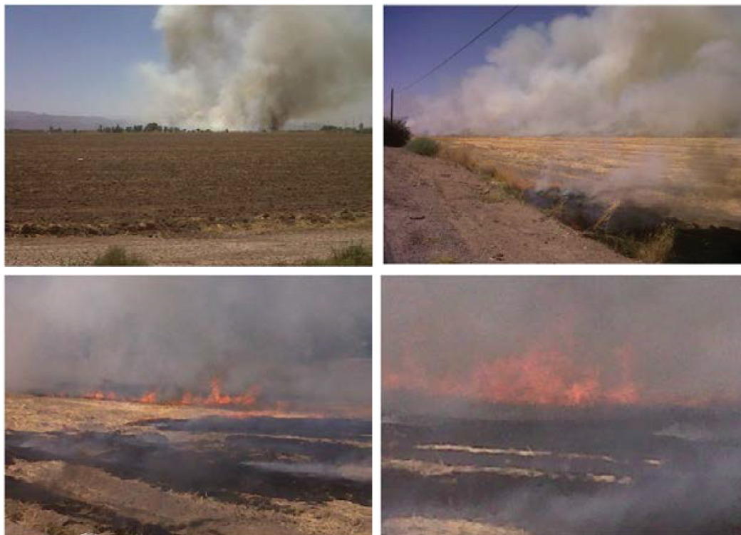
Figure 1. Wheat straw burning practices in Mexico.