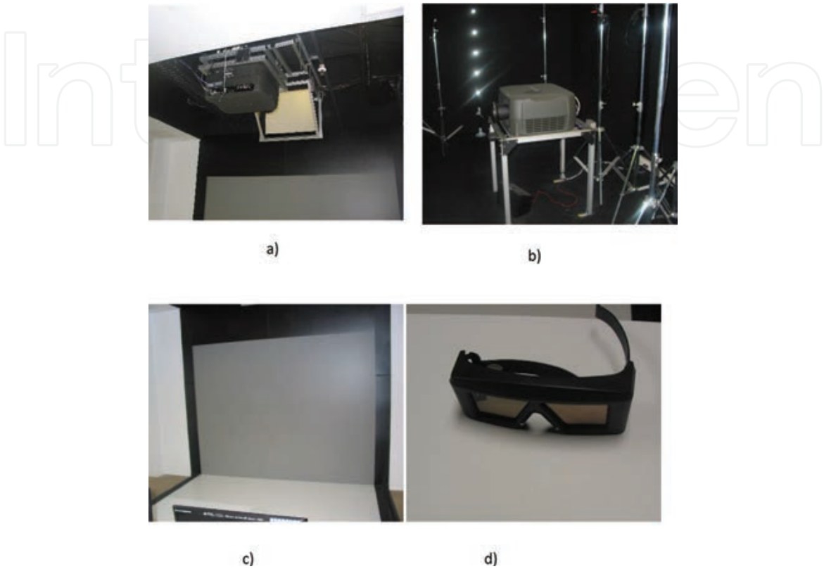
Figure 1. Elements of the virtual reality room. (a) and (b) Projectors, (c) 2 screens in an L shape, and (d) virtual reality glasses.

By way of example, Figures 3 and 4 show some of the immersive virtual environments created.