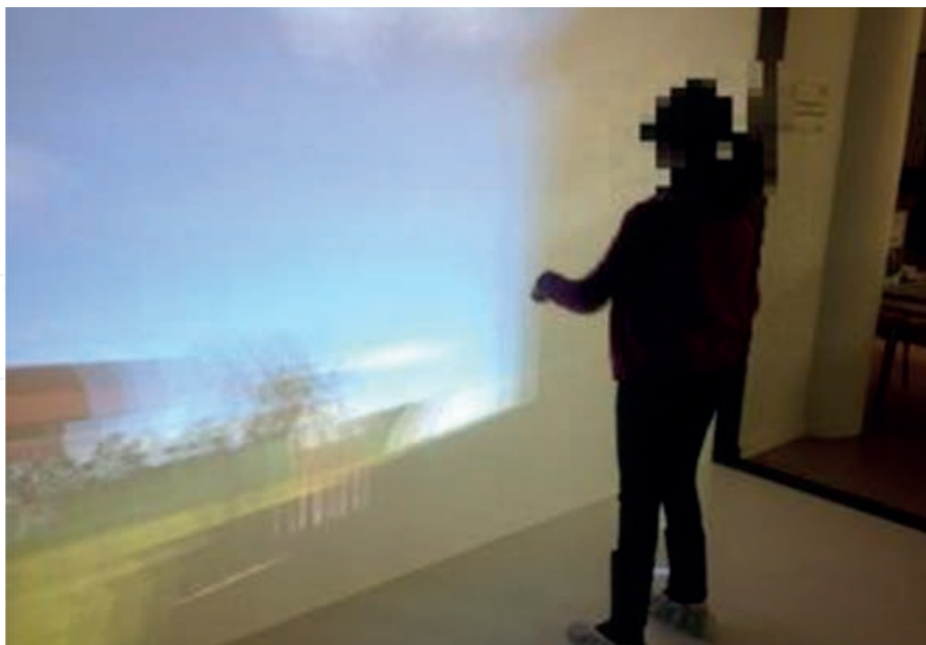
Figure 5. Student from the secondary educational stage performing one of the social stories in the immersive virtual environment.

An evaluation using the PIAV protocol took place while the tasks described above were carried out: body motor coordination control; voice control; look control; attention control; and empathy control. The discussion groups created by the participating teachers on a monthly basis assessed the evolution of students' behaviour in the school tasks, which resembled those undertaken in immersive environments.