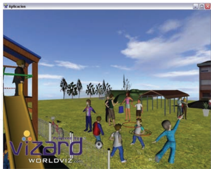
Figure 3. Immersive environment: playground of a primary education school.