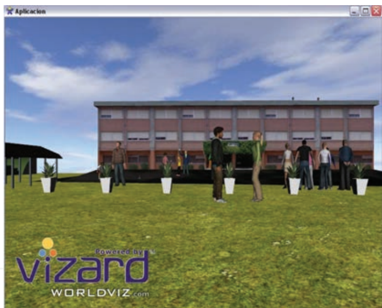
Figure 4. Immersive environment: playground of a secondary education school.

used to deal with their difficulties in social skills and executive functions such as emotional competences; in turn, students with similar characteristics formed the experimental group, but their intervention took place in the immersive learning environments designed. The sample was shaped in the first stage with 10 primary education students from public schools located in the city of Alicante (Spain) and a second group of 10 students from secondary schools also located in Alicante; and in a second stage, with 20 randomly chosen children who had to carry out the tasks in the IVRS and a second group, the control group, 20 children, chosen randomly, will carry out the tasks in the VR.