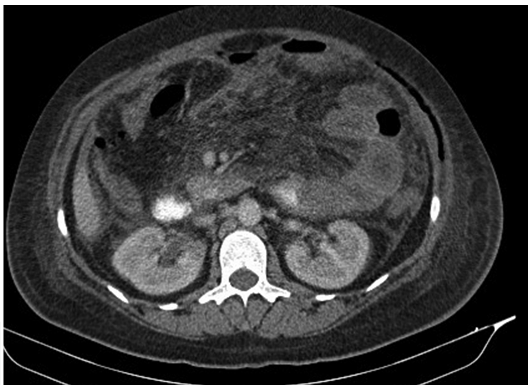
Figure 3. Abdominal CT showing the air in abdominal muscle because of close perforation of sigmoid colon.

Directographies and ultrasonography, when compared with CT, are suboptimal in the evaluation of perforation. CT has been accepted as the best imaging method in revealing the presence, location, cause, and complications (such as phlegmon, abscesses, and peritonitis) of a perforation. Oral and IV contrast agents can be used. The entire abdomen from the pelvis to the upper section of the diaphragm can be scanned with thin slice thickness. The three-dimensional (3D) images can be obtained through multiplanar reconstructions. In the diagnosis of perforation, there are direct and indirect findings of CT ( Figures 2 and 3 ). Extraluminal air and contrast agent and intestinal wall discontinuation are direct findings, whereas a phlegmon, abscess, or inflammatory mass related or unrelated to the intestinal wall are indirect findings [20, 21]