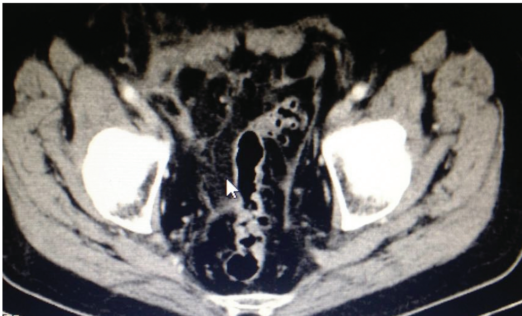
Figure 2. Abdominal CT showing sigmoid diverticular disease and indirect signs of perforation (mesenteric contamination and heterogeneity).

The other method used in the diagnosis of perforation is ultrasonography. It provides fast and easy scanning. It does not include radiation and, therefore, can be preferred in children and in pregnant women. It can detect intraabdominal free or loculated fluid. Also, ultrasonography provides additional diagnostic information. There are studies which state that pneumoperitoneum can be detected with ultrasonography. However, there are also studies stating that it