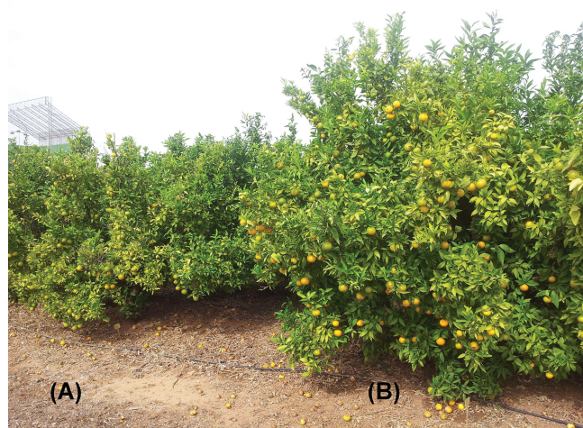
Figure 5. Influence of Citrus rootstock on tree size response at field conditions. (A) Tree on Forner-Alcaide 517 (dwarfing behaviour) and (B) Forner-Alcaide 5 (normal size).

Fortunately, a few Forner-Alcaide hybrid selections exist which also confer a dwarfing response on scions, in particular FA 517 ( Figure 5 ) and FA 418, whose agronomical behaviour has been tested under field conditions [61–63]. Both rootstocks show lower canopy volumes, but higher yield efficiency when compared with Carrizo citrange, the most extended citrus rootstock in Spain [63]. Moreover, they produce good fruit quality and optimal response when cultured in alkaline soils, one of the main factors that limits crops in Spanish soils [61–63].