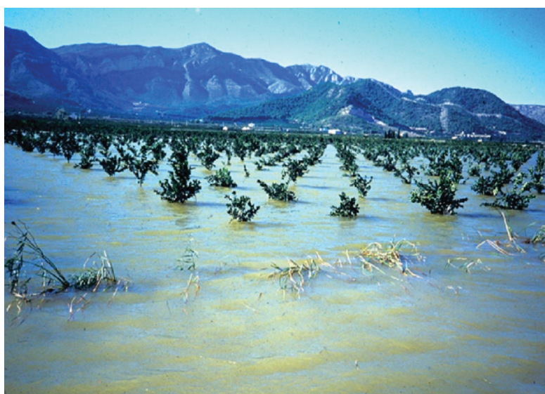
Figure 3. Citrus field affected by flooding stress.

Soil flooding has been widely reported to affect large areas of the world, and generally in relation to poor soil drainage combined with excessive rainfall or irrigation. One major constraint that stems from excess water is the progressive reduction in both the soil \text{O}_2 concentration and redox potential, which leads to the formation of reduced compounds of either chemical or biochemical origin. Accordingly, flooding effects on plants are related mainly to declining aerobic root respiration that impairs ATP synthesis and which, in turn, disrupts plant metabolism and induces a variety of physiological disturbances that alter plant growth [25], including reductions in water flux from roots, hormonal imbalances, altered carbohydrate distribution, deficient nutrient uptake, early leaf senescence and injury in organs, which sometimes precede plant death ( Figure 3 ) [26].