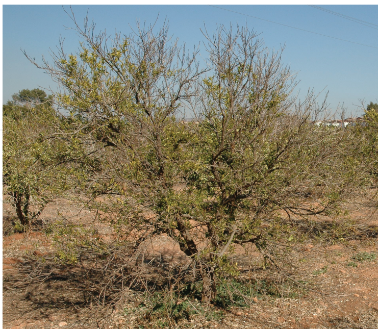
Figure 4. Citrus tree seriously affected by water deficit stress.