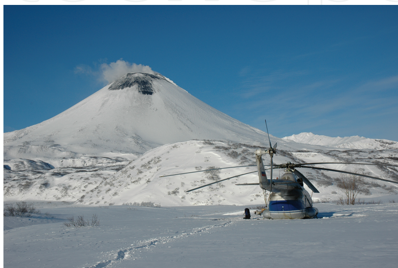
Figure 2. Summit activity on the Karymsky strato-volcano in Kamchatka [Photo by Dmitry Melnikov, Institute of volcanology and seismology FEB RAS, Petropavlovsk-Kamchatsky, Russia].

inside a volcano and hence use collected in situ or near real-time data to estimate volcanic alert status in active volcanoes [24–29]. Gravimetry studies also been used to detect various volcanic structures such as maar-diatreme volcanoes and establish the geological origin of sediment field terrestrial basins, which indeed not as simple process as we might think [30–33]. Similarly, gravimetry has been applied successfully to describe the internal architecture of large volcanoes [34] as well as relatively small-scale features as cavities in lava flows [35]. This chapter provides an easy to understand review of the science behind gravimetry studies then provides an evaluation for the future of gravimetry research on volcanoes.