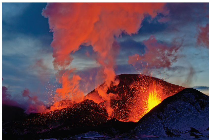
Figure 1. Strombolian style explosive eruption through a fissure vent at the Tolbachik volcano in Kamchatka (2012).

Linked to the previous chapter, the third chapter provides a critical review with some original data and research about the role of volcano gravimetry. Volcano gravimetry has developed dramatically in recent years and became a fundamental tool to understand activity changes