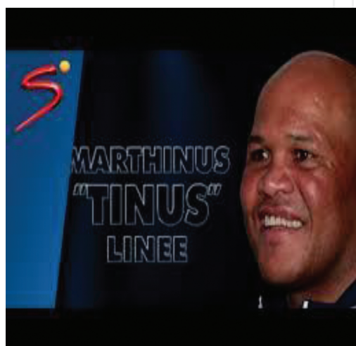
Figure 3. Marthinus 'Tinus' Linee (23 August 1969-3 November 2014) was a South African rugby player. https://en.wikipedia.org/wiki/Tinus_Linee .

Scarmeas et al. [46] published a manuscript, concluding that subjects with ALS were more likely to be slim or had once been serious athletes. Apart from Lou Gehrig, they mentioned many famous people in U.S. history who have had ALS such as: Ezzard Charles (see Figure 2 ) who was a quite famous heavyweight boxing champion. Charles was diagnosed with ALS. The disease affected Charles legs and eventually left him completely disabled. Charles died on 28 May 1975 in Chicago.