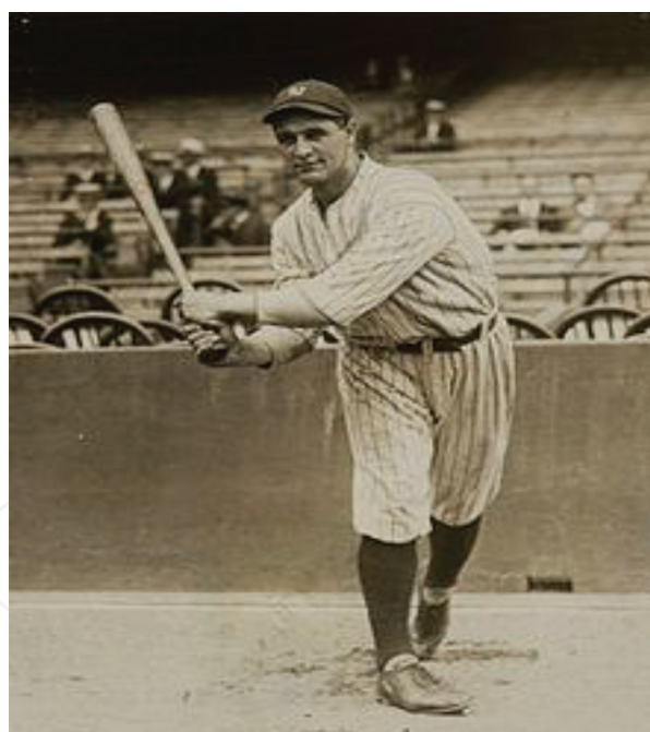
Figure 1. Henry Louis 'Lou' or 'Buster' Gehrig (Born Heinrich Ludwig Gehrig; 19 June 1903-2 June 1941) was an American baseball first baseman who played 17 seasons in Major League Baseball for the New York Yankees, from 1923 to 1939. https://en.wikipedia.org/wiki/Lou_Gehrig .

ALS is better known since 1939, when a famous American baseball first baseman player Lou Gehrig (see Figure 1 ) brought national and international attention to his disease; since then, in America this neurodegenerative disorder is better known as a Lou Gehrig's disease.