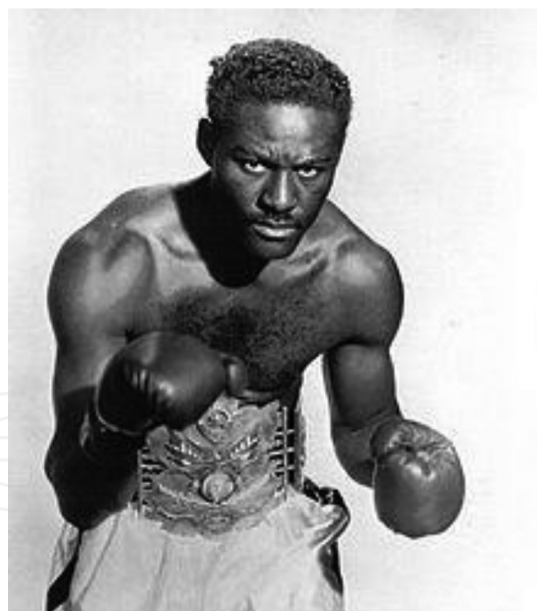
Figure 2. Ezzard Mack Charles (7 July 1921–28 May 1975) was an American professional boxer and former World Heavyweight Champion. https://en.wikipedia.org/wiki/Ezzard_Charles .

Lou Henri Gehrig is one of the most famous people affected by ALS. He was born in the Yorkville section of club and earned the nickname Columbia Lou from adoring fans. Gehrig signed his first contract with the New York Yankees Team in April 1923. Over the next 15 years he led the team to win six World Series titles. Available at the URL: http://www.biography.com/people/lou-gehrig-9308266 .