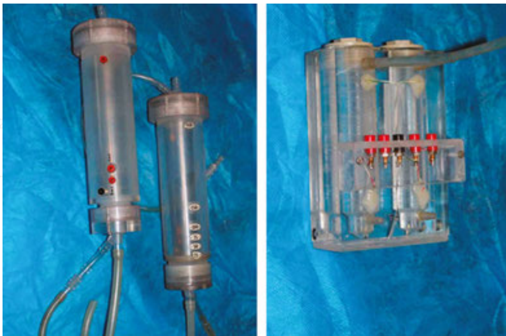
Figure 1. Variety of pumps developed with our design.