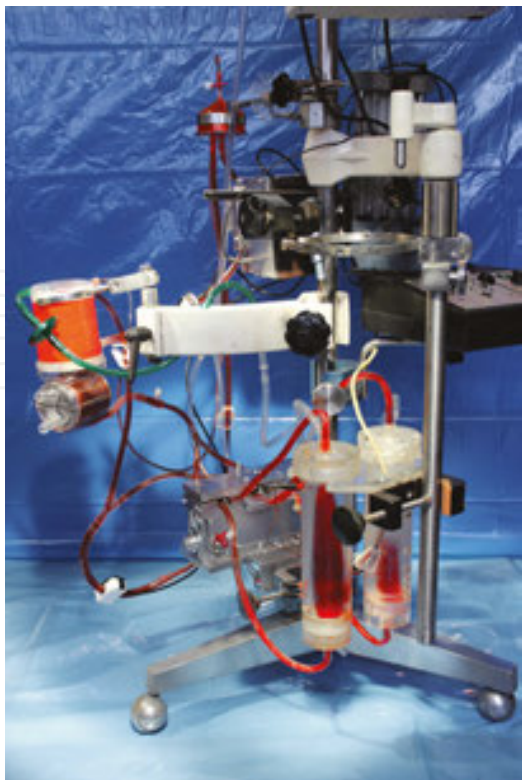
Figure 2. The external view of the pump.