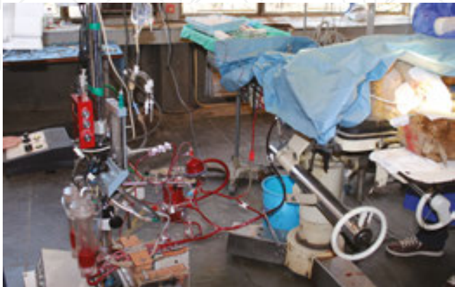
Figure 5. Process of the experiment on animal.