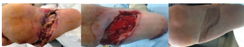
Figure 6. Monocell implants can be used in one step only to prepare wound bed to receive an autologous skin graft. In this case, a severe necrosis of the midplantar skin was excised and PBMNCs injected. A well-vascularized granulation tissue was appreciated in 12 days, allowing repair with a split thickness skin graft in this nonweight bearing area.

Because of their early capability to stimulate vascular ingrowth, monocell implant can be used in one step only to prepare wound bed to receive an autologous skin graft ( Figure 6 ).