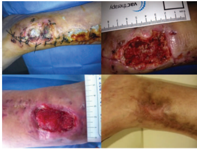
Figure 3. Lipografting in chronic posttraumatic wound in a diabetic patient. Two sessions were needed to obtain a complete closure.

Four patients were treated, wound closure occurred in approximately 17 days ( Figures 2 and 3 ).