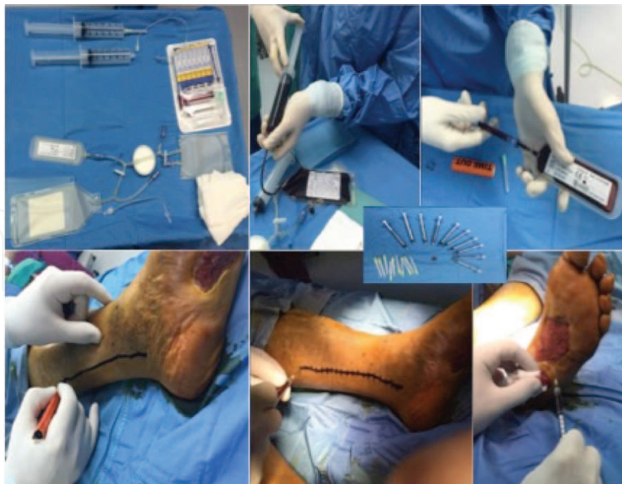
Figure 4. Mononuclear cells preparation procedure: 120 mL of peripheral venous are processed by the WB Pall Celeris system to obtain 12 mL of concentrated PBMNCs, and the posterior tibial axis is traced and the injection performed.

The concentrated PBMNCs were transferred to a 1 mL Luer-Lock syringe to allow a precise control during injection ( Figure 4 ).