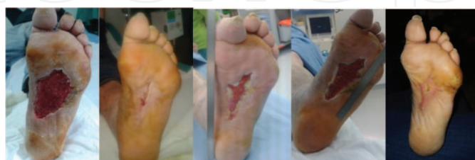
Figure 5. PBMNC injections were repeated three times, once a month for three months, and a complete healing was registered.

After the A-PBMNCs implant, the wound was always covered with hyaluronic acid monolayer. This treatment was repeated three times, once a month for three months ( Figure 5 ).