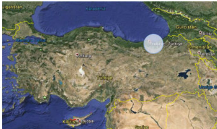
Figure 1. The geographic location of Trabzon [6].

As for Trabzon, it is a city situated in the North eastern Black Sea region of Turkey with a population of about 768,417 and covers an area of approximately 4685 square kilometres [24]. And Trabzon's population growth rate has increased by 1635% over the previous year. Proportion of the residents in the city centre is 41.67%. In addition, located to the Southeast coast of the Black Sea, Trabzon is between the 38°30'–40°30' east meridians and 40°30'–41°30' northern latitudes, as well as surrounded by the cities of Rize in the East, Giresun in the West, and Gümüşhane in the South. Extending Northward from the South, the mountains reach the Black Sea coast as ridges split by valleys and are over 2000 m in places. The amount of active green areas of the province of Trabzon is 867, 673 m 2 , and the passive green space is 437, 960 m 2 (Figure 1).