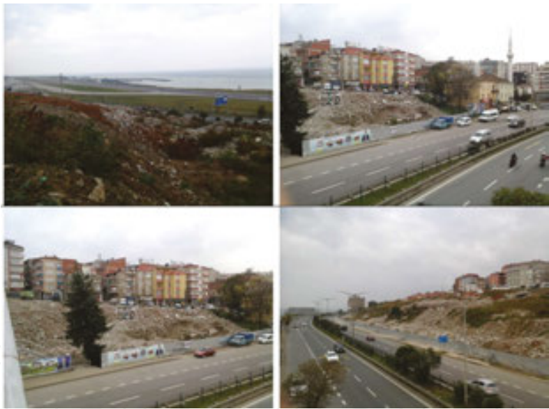
Table 5. The views from Pelitli urban renewal project area.

Ayasofya (St. Sophia) urban renewal project work started on May 27, 2009, with the protocols signed between TOKİ and Trabzon Municipality, and in 2014 it was completed ( Table 6 ). Position of St. Sophia museum in the city silhouette has been emphasized in the project scope besides the recreational landscaping work. Now St. Sophia has been one of the most interesting places of the city for the local and foreign tourists who come to Trabzon. Application of the project has made Ayasofya neighbourhood more liveable and legible, and contributed to its socio-economic development.