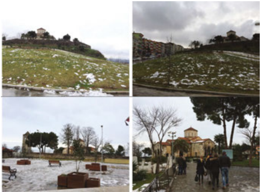
Table 6. The views from Ayasofya (St. Sophia) urban renewal project (Photos, Yavuz A.).

On June 06, 2011, a protocol was signed between TOKİ and Trabzon Municipality for Narlıbahçe urban renewal project work ( Table 7 ). This area, local government buildings, is the second largest centre of the city. Actually, there would be a kind of renewal or renovation application here due to the existence of some historical buildings. But the project is still in the decision process due to some disagreements between the stakeholders. Actually, expropriation price is considered to be relatively high because of the high land values in this area. So, TOKİ