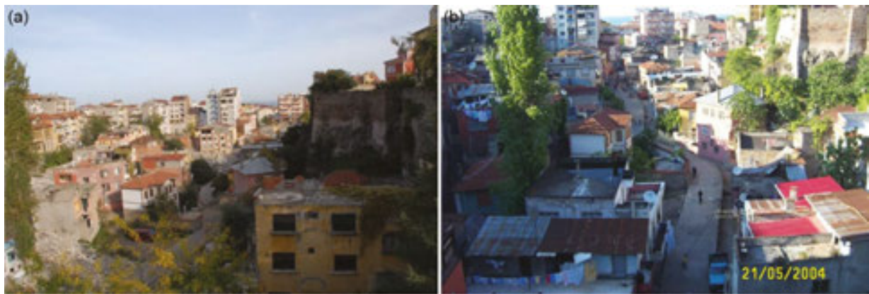
Figure 3. (a) Zağnos valley, (b) Tabakhane valley.

The first serious urban planning in Trabzon was conducted in 1938 by Jaquest Lambert, a French architect and urban planner in its history of 4000 years. According to Lambert plan which entered into force in 1938, Zağnos and Tabakhane valleys have been considered as air corridors to provide natural air flow and a planning approach has been adopted in this regard. These valleys are in the city centre and located in very close proximity to the housing, commercial and administrative centres. Located in valleys, Tabakhane and Zağnos bridges are the constructions well worth to preserve, because they have preserved their characteristics so far in the urban fabric and have an important place in the urban transportation. In addition, the limit of Zağnos valley is surrounded by Ortahisar castle in the Protected Area in Grade 1. Migration of the urban people to the city and the rapid increase in urbanisation has led to a distorted and unhealthy construction as well as degeneration of the natural structures of Zağnos and Tabakhane valleys ( Figure 3 ). Urban renewal project work of Zağnos Valley was started with a protocol dated November 27, 2004, and signed between Trabzon Municipality and TOKİ, and the urban renewal project work of Tabakhane Valley was started in the same way with a similar protocol dated November 12, 2007 ( Table 1 ).