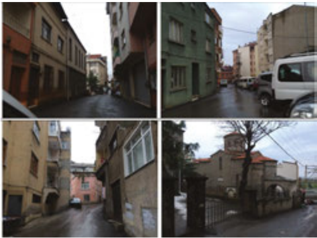
Table 7. The views from Narlibahçe urban renewal project.

On the other hand, the rapid growth and development movements occurring in large cities since the 1950s have led to changes in the physical structure of the city Trabzon, and Beşirli and Pelitli regions are united due to this process. In addition, housing demand and the consequent increase in land prices have excessively disrupted the reconstruction in the city and caused the expansion of landfills in coastal areas. Although completed 5 years ago, the coastal landfills are now ongoing again with an additional project and the coast is subject to