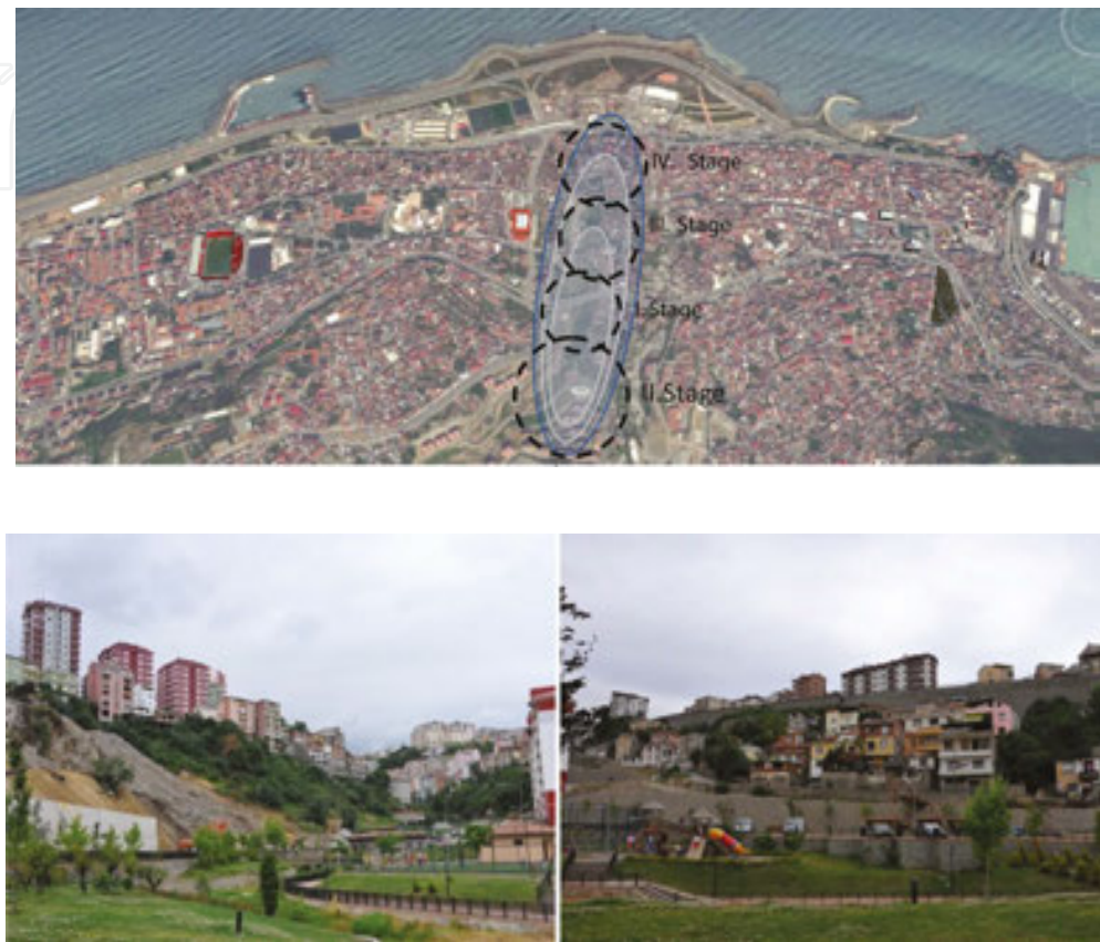
Table 1. The views from 1st, 2nd and 3rd stage, the urban renewal project of Zağnos valley (Photos, Yavuz A.).

As for Tabakhane Valley, the detection process in this area has been completed until 2016 and in addition to expropriation work, demolition process continues ( Table 2 ). Under the project, recreational landscape work and 353 housing production will be carried out. Undergoing the same process applied to the people living in Zağnos Valley, also the residents of this valley have been obliged to be separated from each other and move into other residential places, which seem quite normal or fair for the central and local governments as the main stakeholders of urban renewal or urban renovation projects.