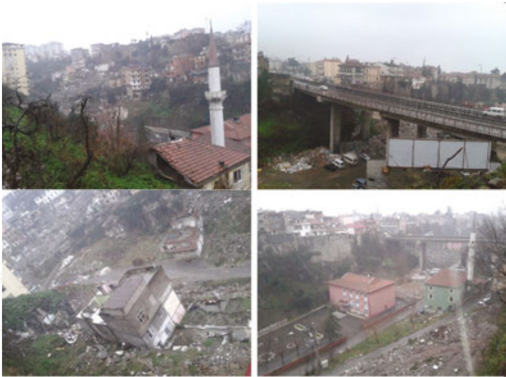
Table 2. The views from Tabakhane valley urban renewal project.

The first phase of the urban renewal process in Meydan Park (park square) was completed in 2012, and the second phase work is still ongoing (Table 3). Under the project, historical buildings have been restored and the square has been renovated and rid of traffic jams. This project can be defined as renewal application–renovation.