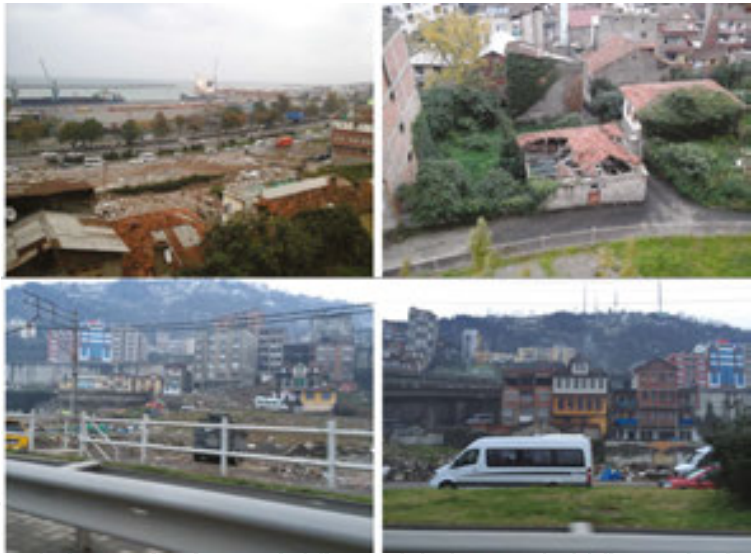
Table 4. The views from Çömlekçi urban renewal project.

Pelitli urban regeneration work began on April 4, 2007, as decided in a protocol signed between TOKİ and Trabzon Municipality ( Table 5 ). Detection, expropriation and project work were completed until 2016. Demolishing work was almost over. The project aims to create a new attraction centre in the project area as well as the commercial and common living area. This project also aims to construct TOKİ houses at a 1.5 km. to the seaside for the house owners in the project area in order to extend the suburb toward the south. Besides, 12 pieces of land will be produced and half of them will be given to the landowners and the others sold to the public. So this is a typical urban clearance.