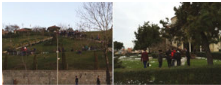
Figure 4. The examples of different activities: open space photography, TV interview.

Unlike the Pelitli suburb example, the regeneration process implemented in Ayasofya (St. Sophia) neighbourhood is an architectural wonder with the church dating back to Trabzon Pontus Greek Empire period, and the neighbourhood, a small-scale commercial as well as residential place. Due to the implemented renewal project, this neighbourhood and the church, now functioning as a historical museum, are relatively more legible. The project has also contributed to the socio-economic and cultural development of the neighbourhood. Especially, the church area is also used for social and recreational activities ( Figure 4 ). When looked from the highway passing through the seaside, you cannot stop admiring the natural beauty and architectural structure and success of the urban renewal application in this neighbourhood. In fact, a specific attention must have been paid to this project due to the historical value, natural beauty and location of the neighbourhood.