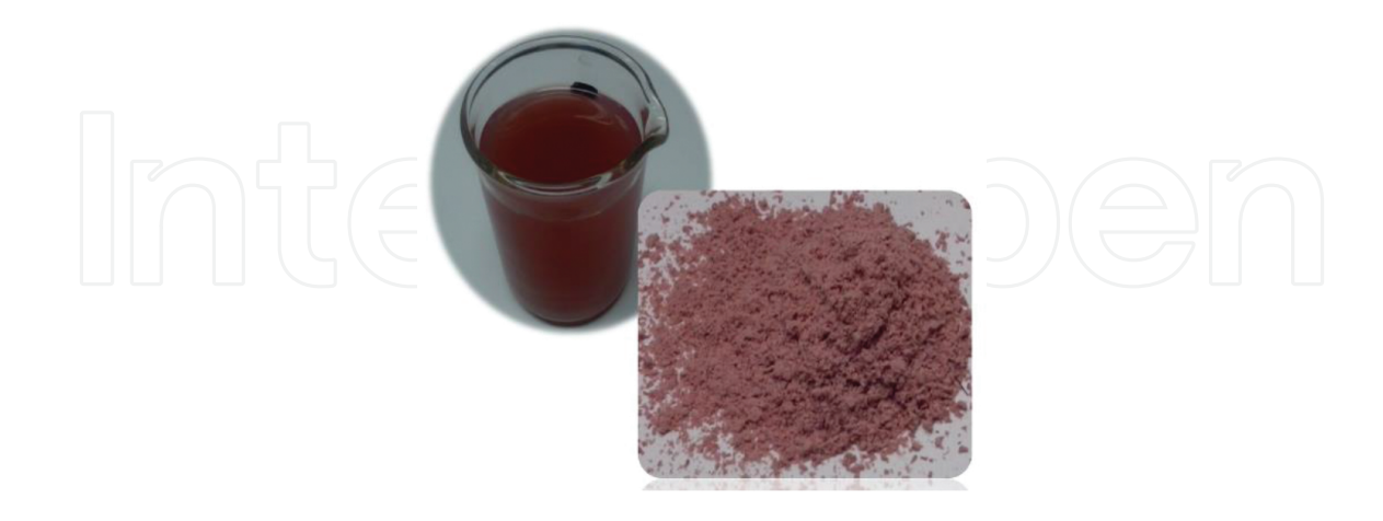
Figure 2. Images of the xoconostle juice and the xoconostle juice powder obtained by spray drying at 110°C/60°C as inlet/outlet drying air temperatures.

Spray drying of xoconostle juice was conducted with low content of maltodextrin as carrier substances, improving the drying characteristics, avoiding technical problems such as the presence of sticky powder and the accumulation of wet material on the walls of the drying chamber and the mechanical cyclone. Although xoconostle juice contains a very low solid concentration (3°Brix), this value was the reference to choose the quantity of carrier agents to be mixed with the juice. The relation of juice solids-maltodextrin (1:1) was enough to reach yield levels from 42 to 79%, the best drying condition being at 110°C/60°C, to obtain the highest powder recuperation ( Figure 2 ). This fact could be affected by the powder density and mean particle size, by keeping constant the concentration of the feed flow and atomizer pressure (0.6 Bars). Low drying air temperature produces compact and small particles, as reported by Alamilla-Beltrán et al. [31].