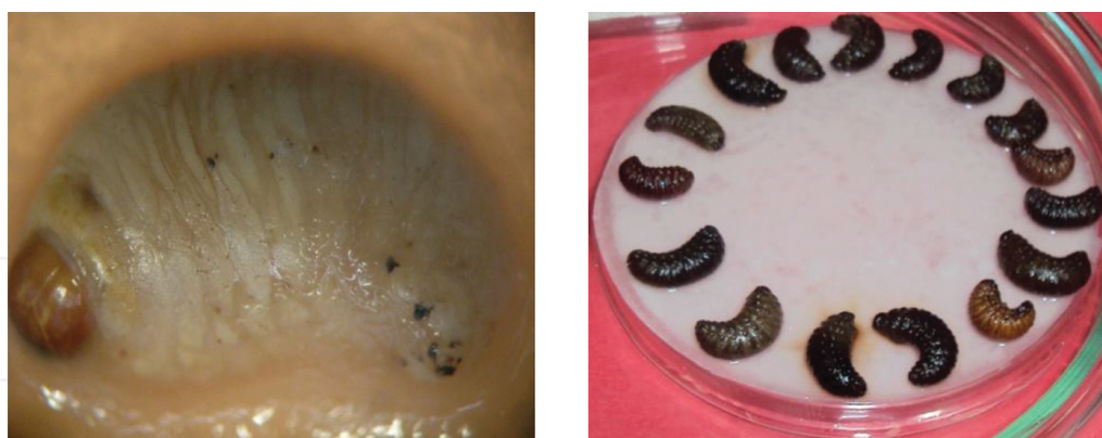
Figure 1. Different colours of the dead Curculio nucum larvae on white traps after EPNs infection.

The insect cadaver becomes red if the insects are killed by Heterorhabditids and brown or tan if killed by Steinernematids ( Figure 1 ). The colour of the insect host body is indicative of the pigments produced by the monoculture of mutualistic bacteria growing in the host insects [1].