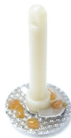
Figures 2. Detail of the blades system which disaggregate the periosteal tissue.