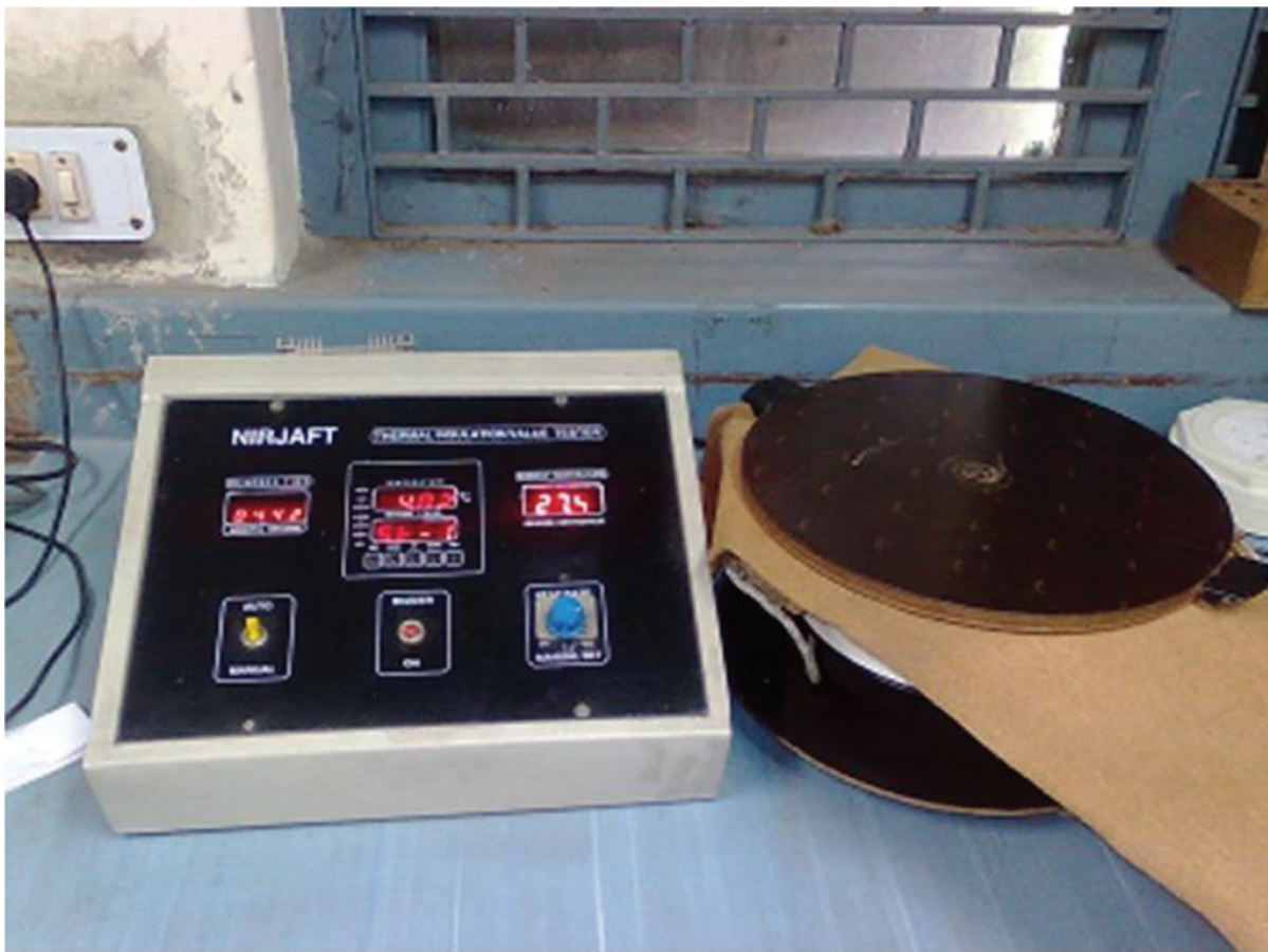
Figure 1. Instrument for measuring the thermal resistance of fabrics.

In this experiment, guarded two-plate thermal resistance instrument has been used to measure the thermal resistance of jute-based needle-punched fabrics ( Figure 1 ) [4–6]. The thermal resistant instrument is based on a microprocessor and provides automatic results of thermal