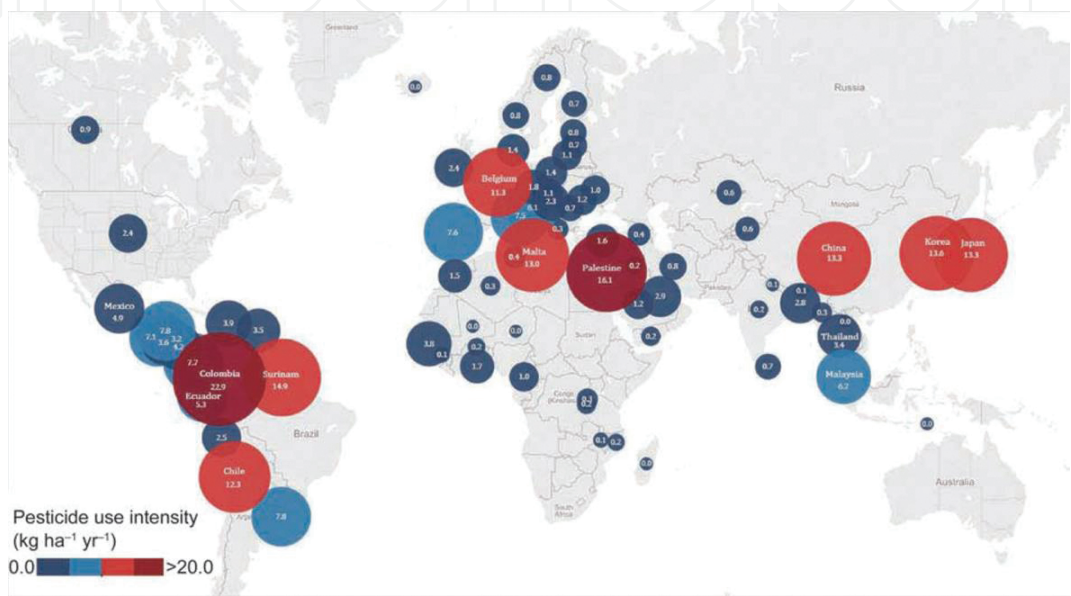
Figure 1. Average annual pesticide use intensity ( \text{kg ha}^{-1} \text{yr}^{-1} ) on arable and permanent cropland from 2005 to 2009. Data are from FAO [57].

to preharvest pests. With the expected 30% increase of world population to 9.2 billion by 2050, there is a projected demand to increase food production by 70% according to Popp et al. [55]. Although nonpesticidal tools have a vital role, there will be a continuing need for pesticide-based solutions to pest control and food security in the future [55,56]. Figure 1 shows the average pesticide use intensity ( \text{kg ha}^{-1} \text{yr}^{-1} ) on the cultivable and permanent cropland worldwide. High use intensity countries above 10 \text{ kg ha}^{-1} \text{yr}^{-1} include Surinam, Malta, Columbia, Palestinian, Japan, Korea, Chile, and China [57]. Figure 2 presents that pesticide sales are increasing in Europe, Asia, and Latin America [58,59].