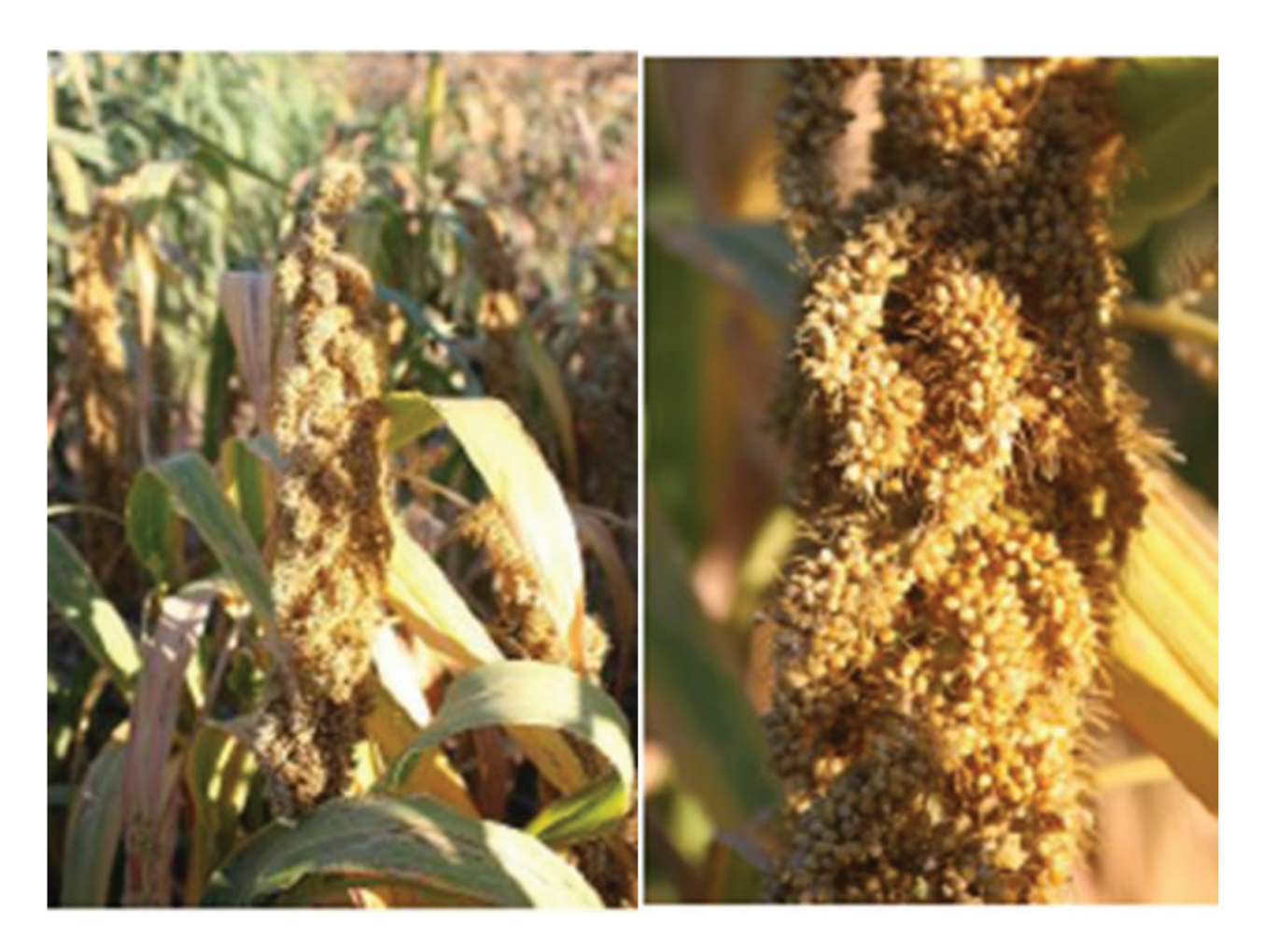
Appendix II. New genotype of Setaria italica 'Rucereus' bred for conditions of the Central Europe.

Sorghum and Foxtail Millet—Promising Crops for the Changing Climate in Central Europe 21 http://dx.doi.org/10.5772/62642