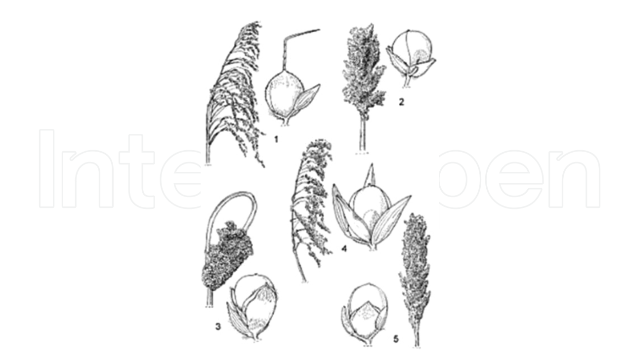
Figure 2. Panicles and spikelets of the 5 basic races of sorghum: 1–bicolor; 2–caudatum; 3–durra; 4–guinea; 5–kafir [18].