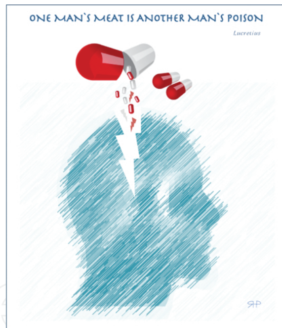
Figure 3. Deleterious effects of antidopaminergics in Parkinson's Disease.

In conclusion, avoiding drugs known to exacerbate motor symptoms should be a priority. Clozapine and quetiapine should be preferred among antipsychotics [9]. Regarding antiemetic use, low dose of domperidone seems reasonable.