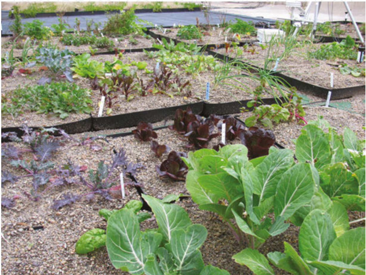
Figure 8. The Texas A&M University green roof modules on the Langford Building with crop varieties shown here with about 3 months' growth.

marketable biomass. Parsley was also a productive crop, and generated the most biomass per capita. Red Russian kale generated proportionally the most non-market biomass, as 72% of its biomass production was lost to aphids. While the lettuce varieties were nearly equal in terms of productivity, marketable biomass output was dominated by a single variety of each kale, parsley and spinach. Leafy greens, including lettuce and parsley and other herbs, were found to be viable [21].