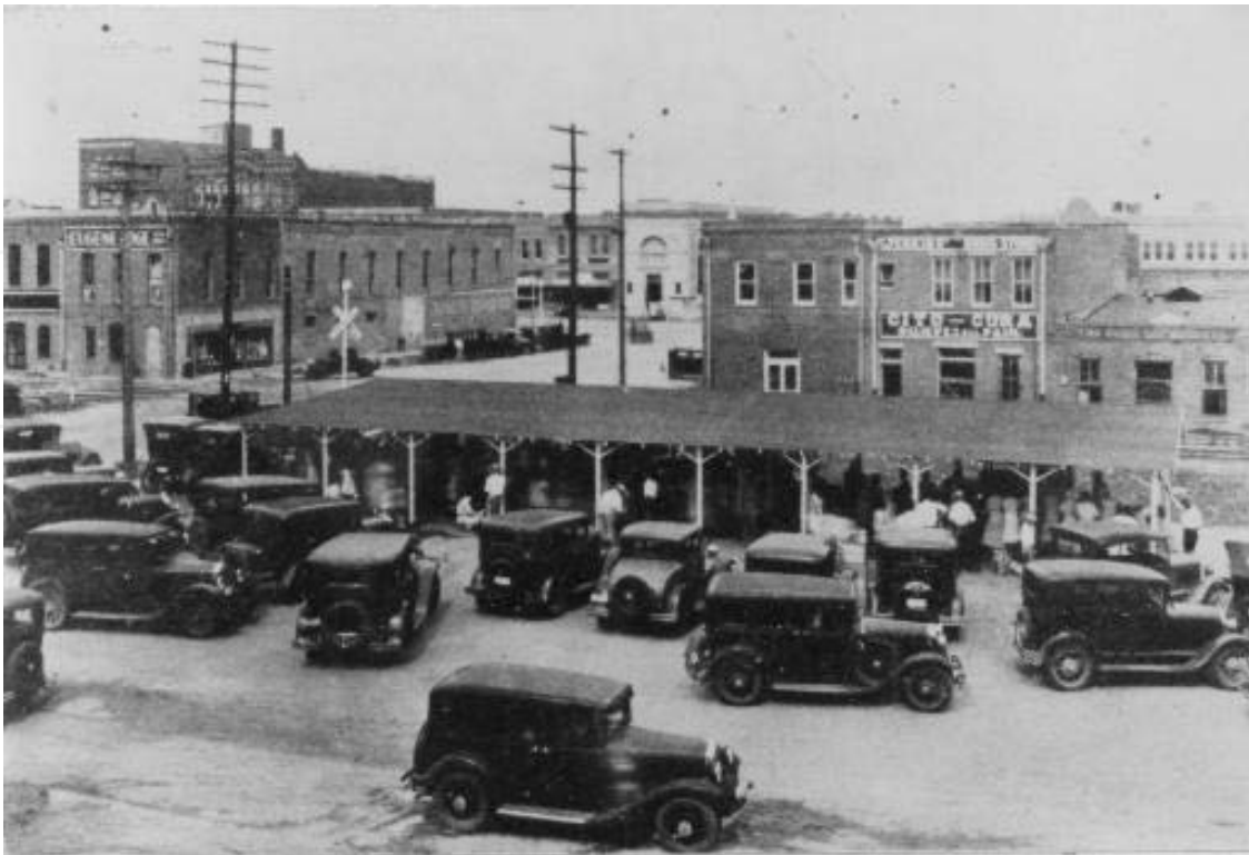
Figure 2. City of Bryan Original Farmers Market Circa 1931 (photo from Downtown Bryan Association).