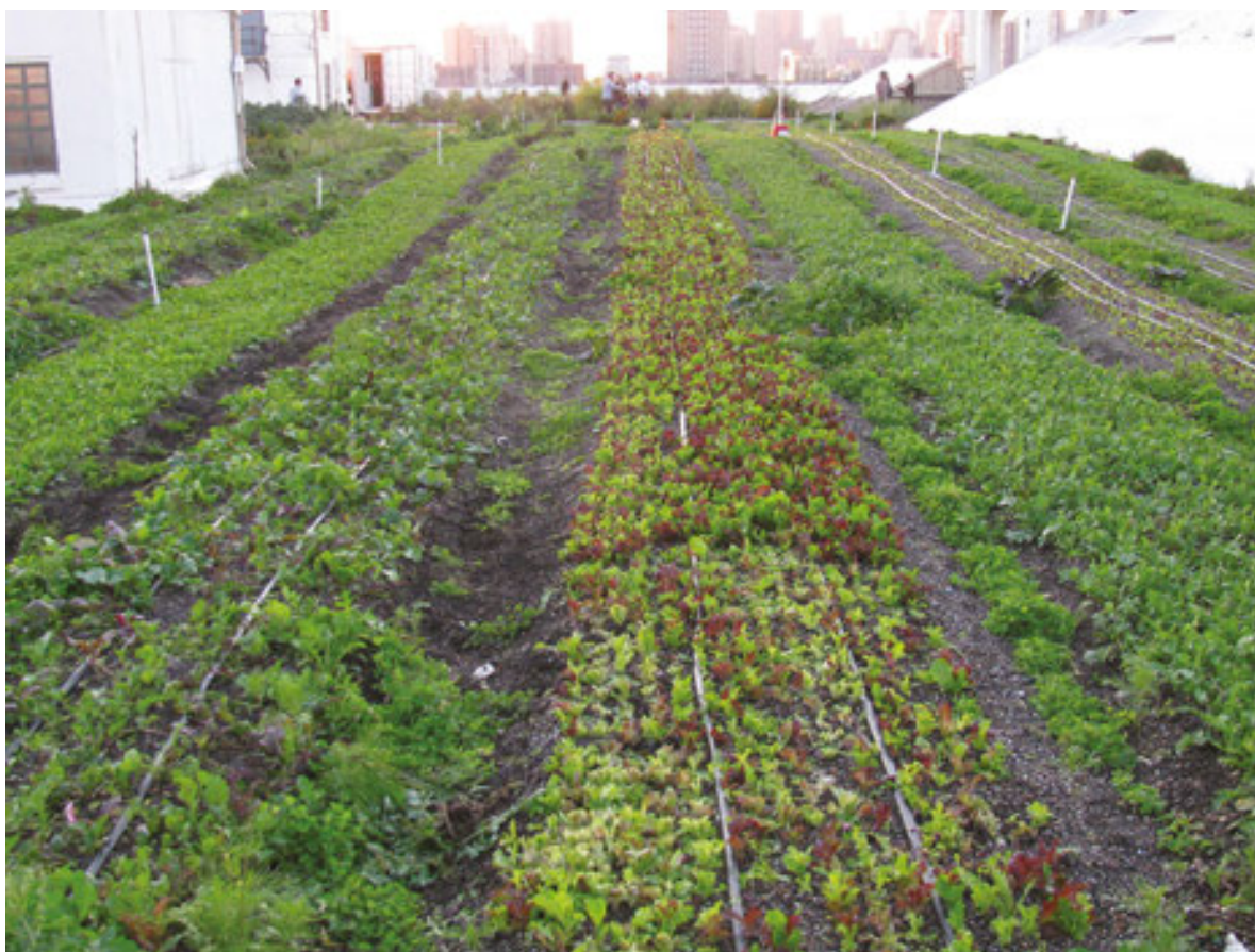
Figure 7. Brooklyn Grange rooftop crops and drip tube irrigation are shown in the foreground, with the New York City skyline in the background.

Large-scaled rooftop farms can and do make a much more visible and widespread impact. In Brooklyn, New York, for example, the Brooklyn Grange, a one-acre rooftop, hosts one of the largest and most active open sky rooftop agriculture production sites in the United States ( Figure 7 ). A project brief here outlines some of the important components and functions of rooftop agriculture. The crops on the Brooklyn Grange include vegetables, herbs and cut flowers. Crops grow in raised mounds from 20 to 25 cm high. The soil is a manufactured growing medium supplied by Rooflite®. Irrigation is provided by drip lines watered daily for 30–40 min depending upon watering needs of plants and weather conditions. There are also a few chickens raised on the roof. Environmental concerns over growing plants and food production on rooftops are valid and can only be determined through individual research. The Brooklyn Grange site has been subject to a few studies and was determined to leach slightly high levels of pH, runoff that is more turbid than a comparison sedum green roof [1]. This