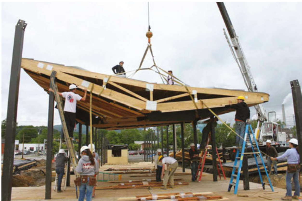
Figure 3. Covington Farmers Market, Virginia (used with permission).

The market, which opened in late May 2011, was conceived as three parts: Ground Plane, Occupied Space and Pavilion Roof ( Figure 3 ). Offsite prefabrication was a key factor in dissecting the market into 10' wide sections, which were put together at the fabrication facility of the university, then transported and assembled on site. The clarity of the project components gave much appreciation to the articulation of its architectural elements. The roof stands as the highlighted figure of the project with its sculptural form, the floor as a floating performance stage and the slender steel posts are carefully inserted in between the two planes and autonomously rising. The project was a yearlong process that focused on the research, development and implementation of innovative construction methods and architectural designs.