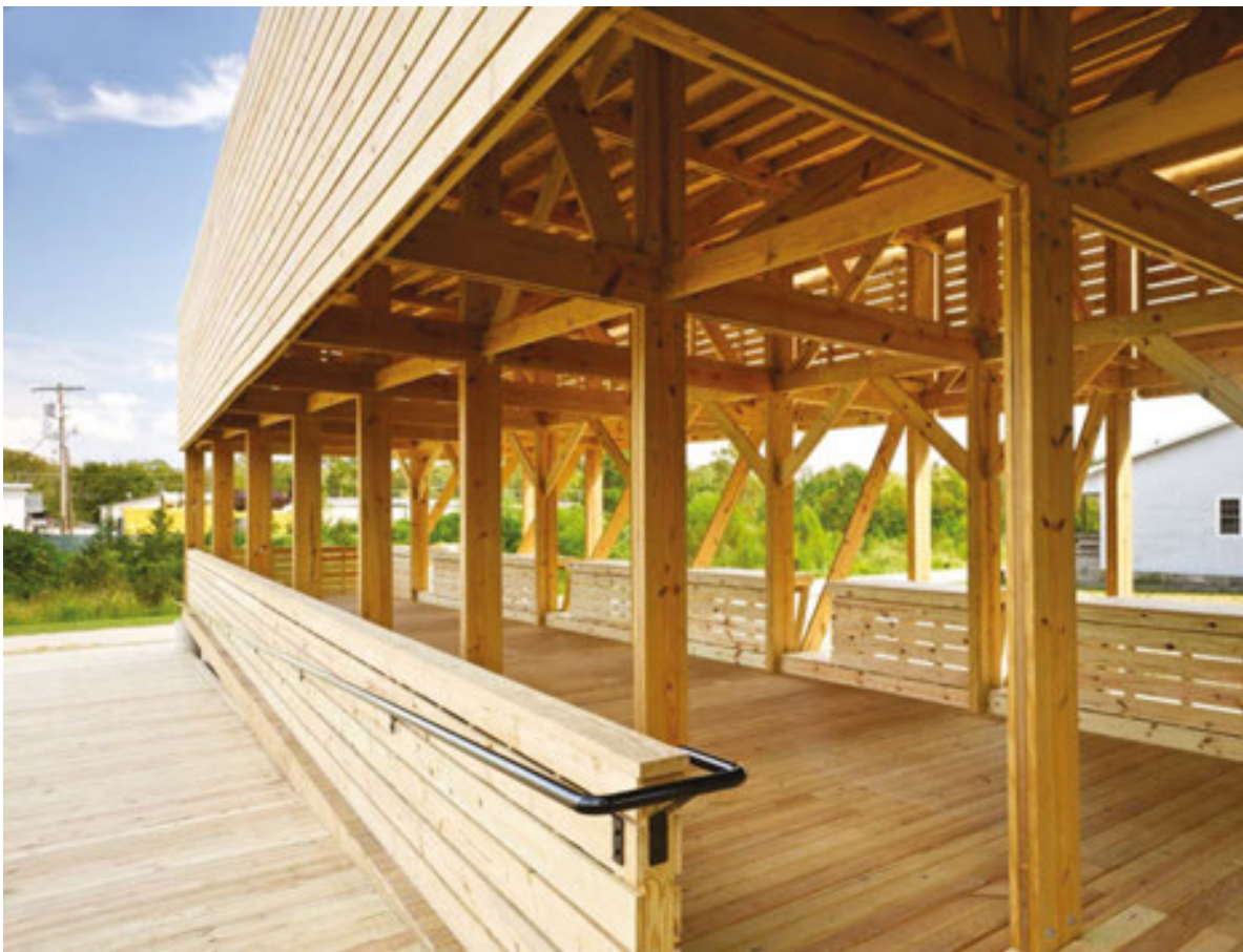
Figure 4. Bertie County Farmers Market, North Carolina (used with permission).

The Windsor Super Market is the only farmers market pavilion in the country designed and built entirely by high school students. The first Studio H project, by 13 high school juniors from Bertie County, North Carolina, constructed the 2000-square-foot structure. Our students spent two semesters and the following summer researching, prototyping, engineering and building the structure, as well as spearheading the launch of the local farmers market association in their hometown of 2000 people. The story of the Windsor Market is told in a documentary film, “If You Build It” [9].