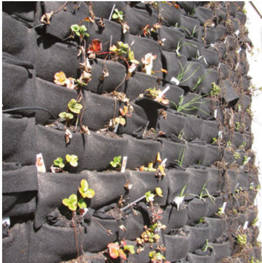
Figure 9. The living wall crops shown here after 3 months' growth. Plant survival was favorable; however, plants did not produce much fruit. Strawberry plants had high survival, but few to no berries were produced.

and the experiment ended. We learned that different varieties of a given crop may respond differently to the micro-climate conditions of the living wall. The water delivery system was not effective as we found that some portions of the wall remained dry and others were sufficient. Subsequently, after this study we removed the drip emitter watering system, which was out of alignment with the planting pockets, and replaced it with a soaker hose system for even distribution.