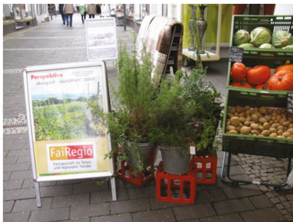
Figure 1. Local goods grown in the public right-of-way in Andernach, Germany, for sale in a downtown market.

One unique example of a municipal level (top down) production of crops outside North America is the Edible City Project at the village of Andernach, Germany [2]. There, the public right-of-way is used in the town Center to grow fruits, vegetables, cut flowers and some produce such as fresh chicken eggs. Permaculture concepts are implemented to maximize healthy yields and reduce environmental risks. The yields are free to the public via self-picking, but programmed harvests are organized by local unemployed workers under the direction of a city program. There, the workers earn a minimum wage and learn marketable skills such as growing food, harvesting, selling and managing operations. The food is produced organically at a small scale in the city proper, but a larger permaculture farm exists outside the village to sustain greater quantities of produce for the local outlet. Proceeds go to reinvesting in the program. Seasonal crops and cut flowers are sold in the downtown market ( Figure 1 ).