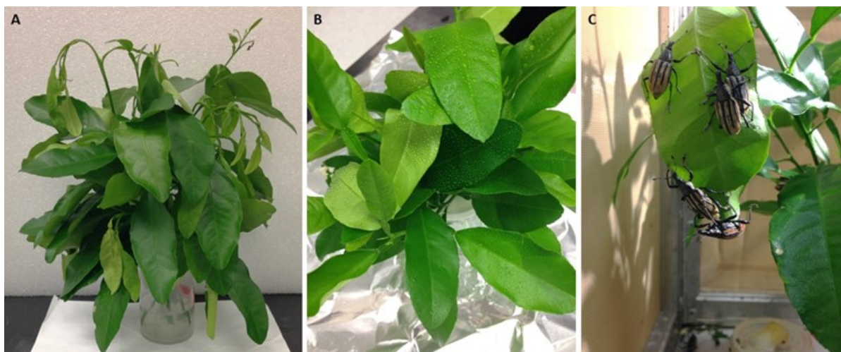
Figure 3. Citrus “leaf bouquet” feeding bioassay for Diaprepes root weevil. (A) Fresh stems with leaves are washed in 0.2% bleach water, rinsed with Nanopure™ filtered water, then the stems are freshly cut while submerged in water. The leaf bouquets are placed in water-filled containers and placed under artificial lighting for 24 h prior to use. (B) Topical foliar treatment: the dsRNA is mixed with water and applied using a low-volume aerosol sprayer. (C) After the leaves dry, the “bouquets” are caged with adult insects.

Similar results were obtained while developing an RNAi strategy against the Diaprepes root weevil (DRW), Diaprepes abbreviatus L., (Curculionidae: Coleoptera) (Andrade and Hunter). The adults feed and oviposition on mature citrus leaves. Topically applied dsRNA was sprayed on a bouquet of citrus leaves for delivery to DRW adults (Figure 3A). RNA's have been shown to move through the plant xylem and phloem [6].